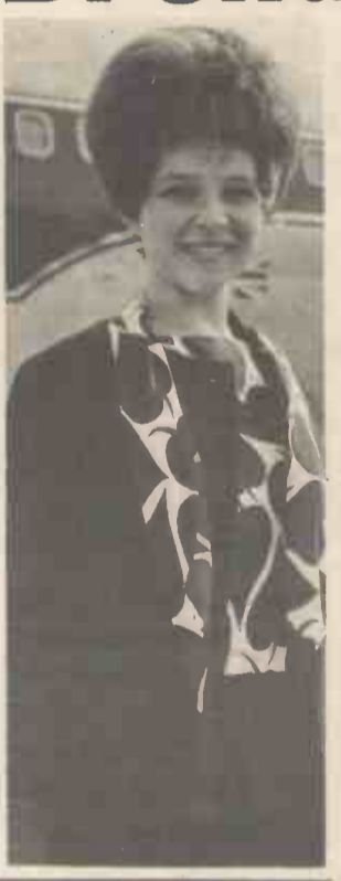
Peter and Gordon, Bournemouth Pavilion; Dusty Springfield, Eden Kane, Brighton Hippodrome.

BRENDA LEE flew into London on Sunday for a hectic schedule of radio and TV recordings and to record a special single at Decca's London studios. Supervised by Animals' and Nashville Teens' producer Mickie Most, the session was held on Monday night. Brenda waxed a number of titles and Decca will rush release two of the sides on Brunswick. The radio-T.V. plugs on shows like "Top Gear", "Lucky Stars" and "Saturday Club" should help to see that the single—expected at press time as first reported in RM last week to be "You Can't Catch Me"—should shoot into the charts. The disc will get added impetus in a month's time when Brenda tours here with Bill Haley. Before Brenda leaves on Saturday she will be a panellist on "Juke Box Jury."