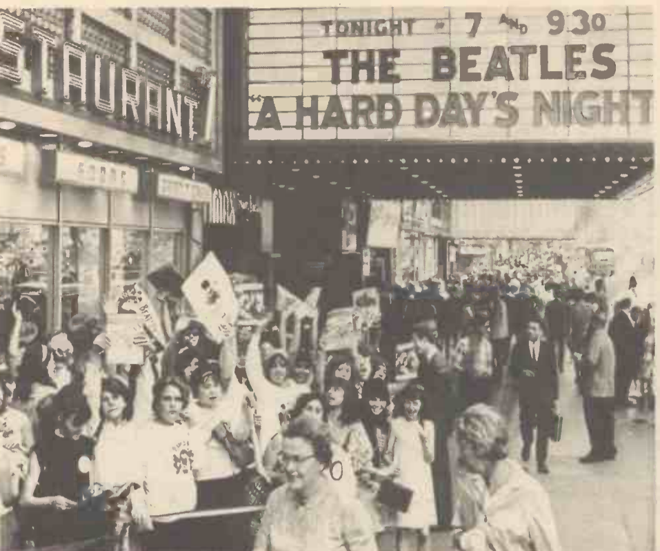
TEENAGED girls of The Beatles' Fan Club in New York wave placards outside the Astor theatre in Times Square, before the premiere there of "A Hard Day's Night".

Gerry and the Pacemakers recorded. "It's Gonna Be All Right" from their film, "Ferry Cross The Mersey," last week. The disc will be released on August 28.