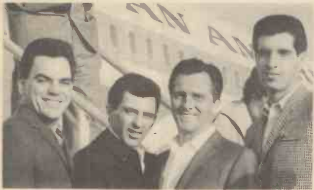
THE FOUR SEASONS