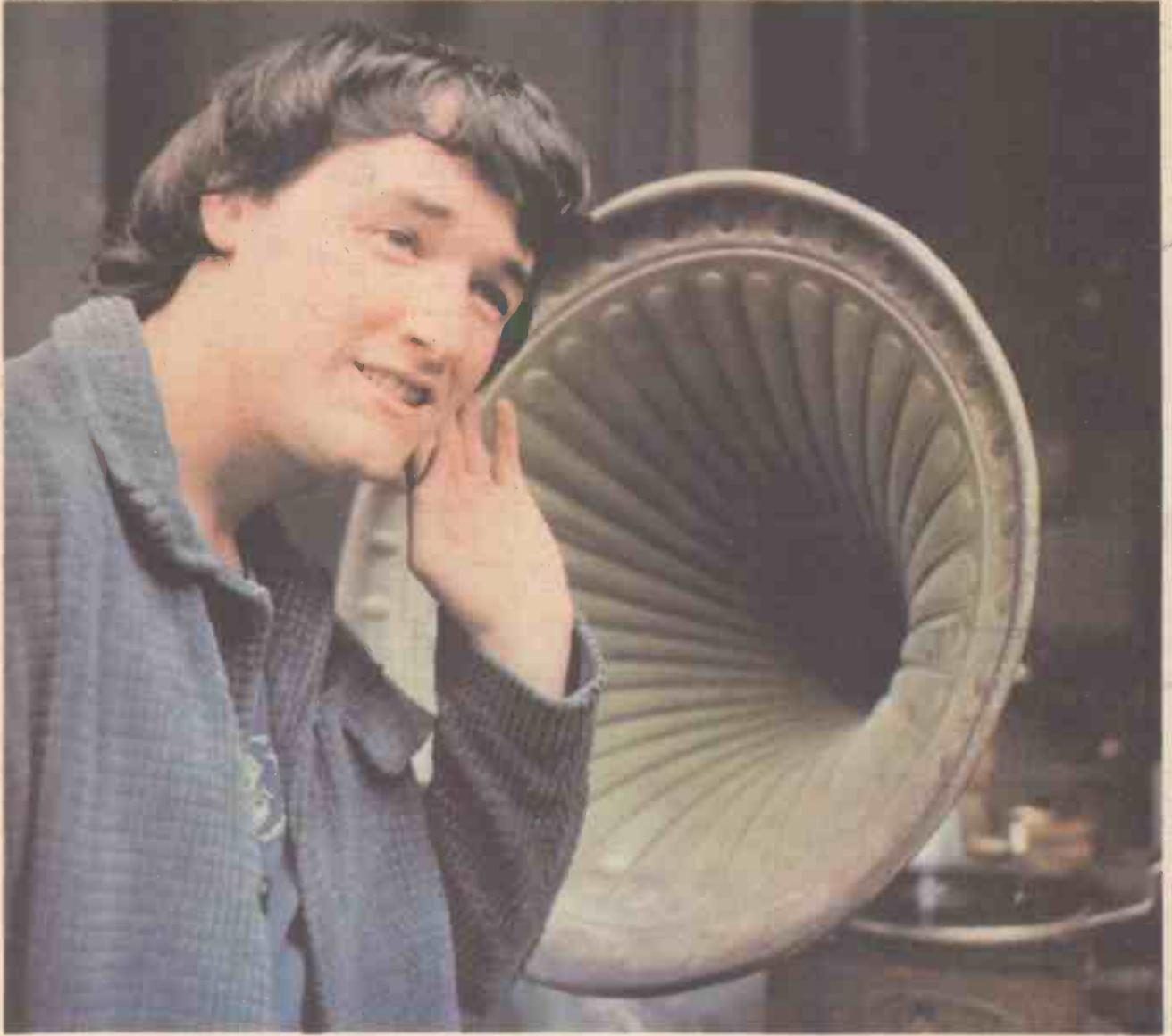
P. J. PROBY—quite a delay between "Hold Me" and his next Decca release.

"I love the little mod girls. Over here they dress well, but American girls can't afford to dress in European fashions."