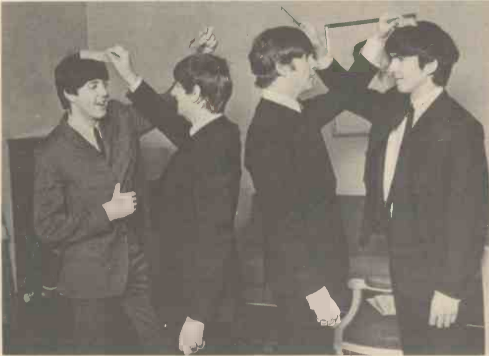
THE BEATLES—an unusual RM pic of the foursome