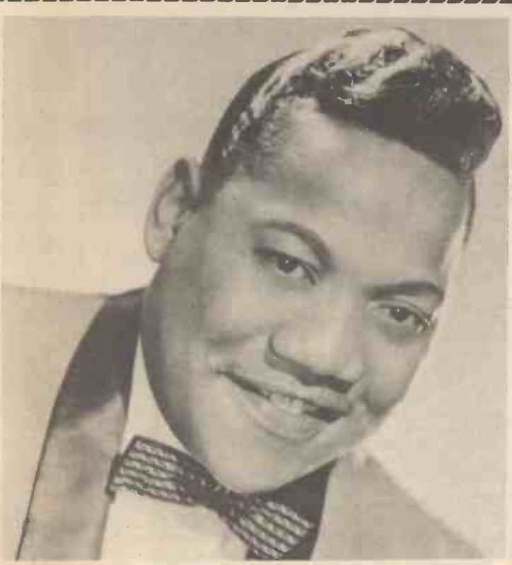
BOBBY "BLUE" BLAND —immensely popular in the States, but doesn't mean a thing here. The latest and fitting subject of this "Great Unknowns" feature.