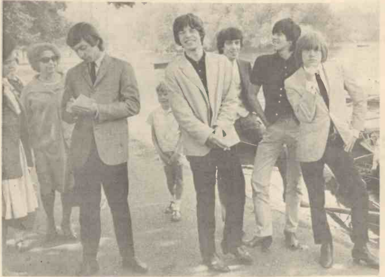
THE ROLLING STONES—their new E.P. looks all set to top the E.P. charts in a few weeks.

"2120 South Michigan Avenue" is fast organ instrumental with an appealing lead line on the organ, and some gutsy instrumental work