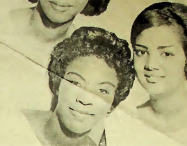
THE JAYNETTES—One of the most off-beat discs of the year must have been "Sally Go Round the Roses" by the Jaynettes. It reached number two in the States and just missed the top fifty here. Their new disc in the States is a Christmas offering.