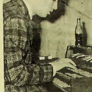
GEORGIE FAME one of Britain's leading R & B exponents has acquired a staunch following with his own earthy brand of music.