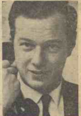
BRIAN EPSTEIN (NEMS) to be congratulated—and envied. His group are 1, 2 & 3 in the Top 50 this week.