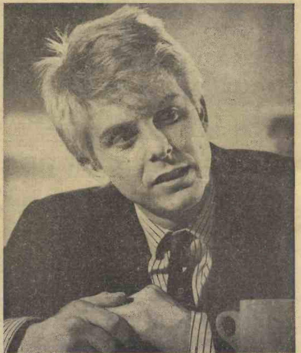
★ BANG! — The HOLLIES are right on target as they "shoot up" the charts with "JUST LIKE ME" on PARLOPHONE. They are at No. 26 this week. You can read more about them on the centre pages.