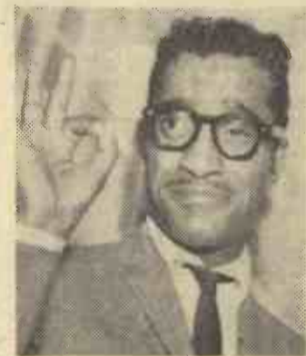
SAMMY DAVIS—Good, but maybe not for the charts.