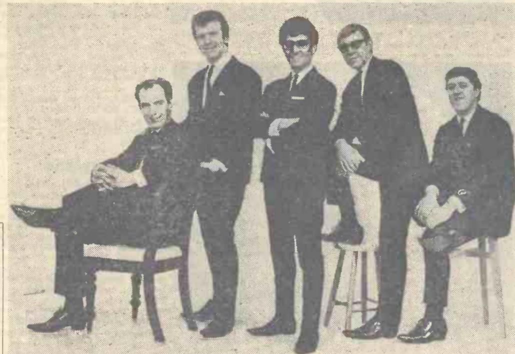
Spear-heading the Manchester challenge to Liverpool are FREDDIE and the DREAMERS, whose lilting and catchy "IF YOU GOTTA MAKE A FOOL OF SOMEBODY" is resting solidly at No. 7 this week. COLUMBIA is the label in their case. A really talented and well-dressed team — as are the HOLLIES.