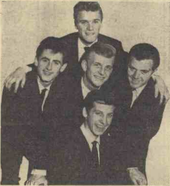
FREDDIE STARR and the MIDNIGHTERS are no less than sensational as a visual act. That they sound pretty good, too, will soon be general knowledge, as their JOE MEEK-produced disc for DECCA gets the air plays.

"I'll never forget that recording session. Freddie was one bundle of energy, impersonating many other