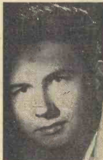
ROY ORBISON: No glasses here. The quiet man of music, currently making a big tour success.

So many of our own artists learn to fling themselves around before they bother to learn to sing. Nice to think that at least one international star has done it the other way round!