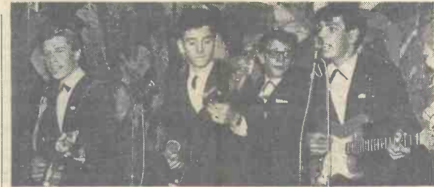
Another fast-rising team are the WHIRLWINDS who, like most Northern teams, make a speciality of the R&B style. With just a very few of Manchester's groups listed here it looks like another Liverpool scene all over again. Where next? GLASGOW? BIRMINGHAM? — YOU TELL US!