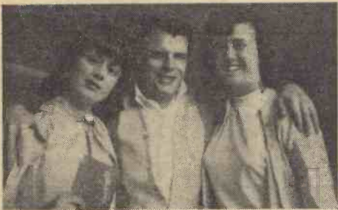
PAT JOYWER and MOE MOULDER with top pop star DEL SHANNON.