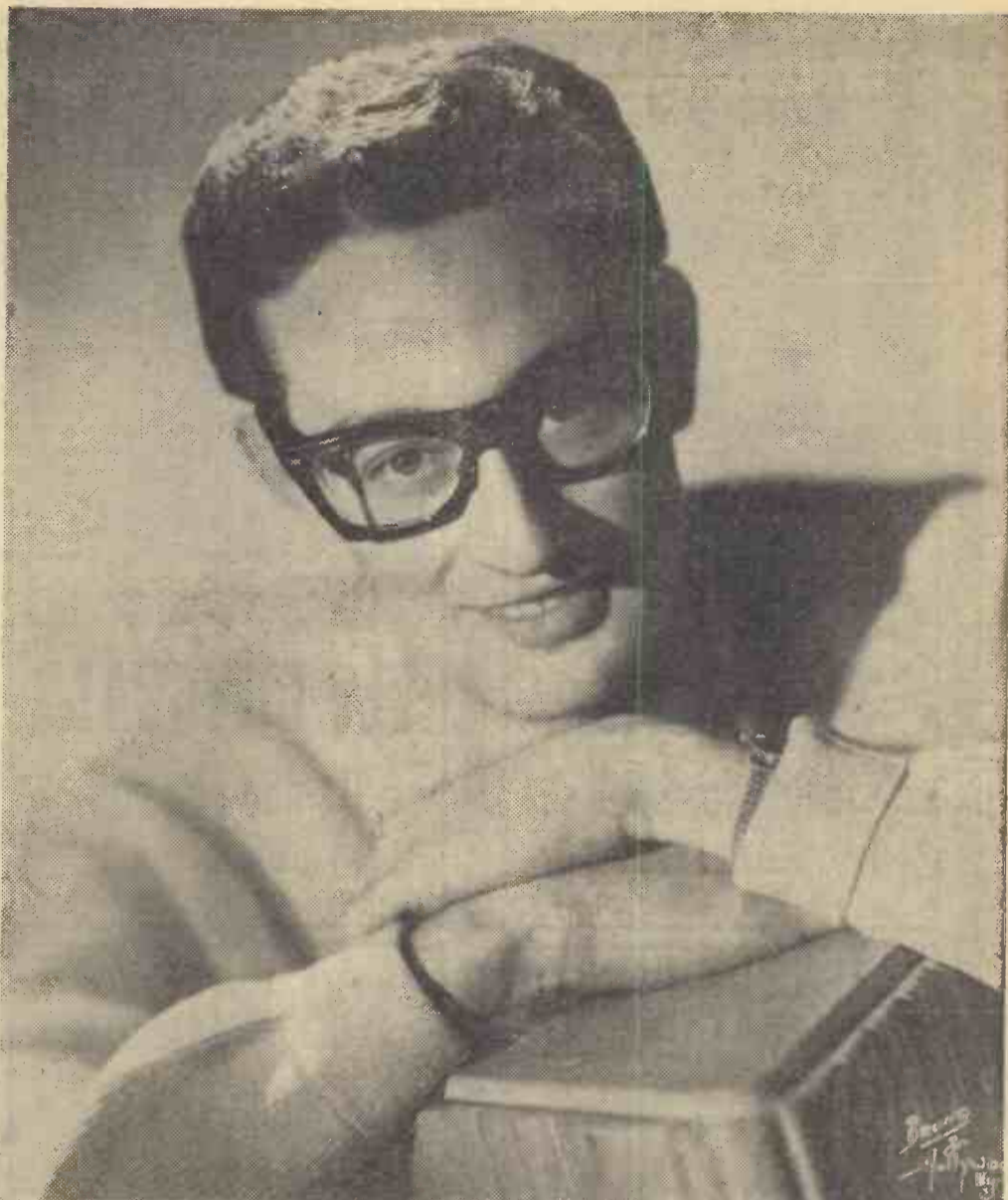
The disc career of the truly fabulous BUDDY HOLLY is spotlighted by NORMAN JOPLING.

Extra singles were issued in the States—but they are all included on album tracks here. The mystery track "You're The One" and the coupling WERE issued in the States but never released to the general public because of copyright difficulties with Buddy's wife. Many copies it is reputed are in the hands of U.S. Dee-Jays.