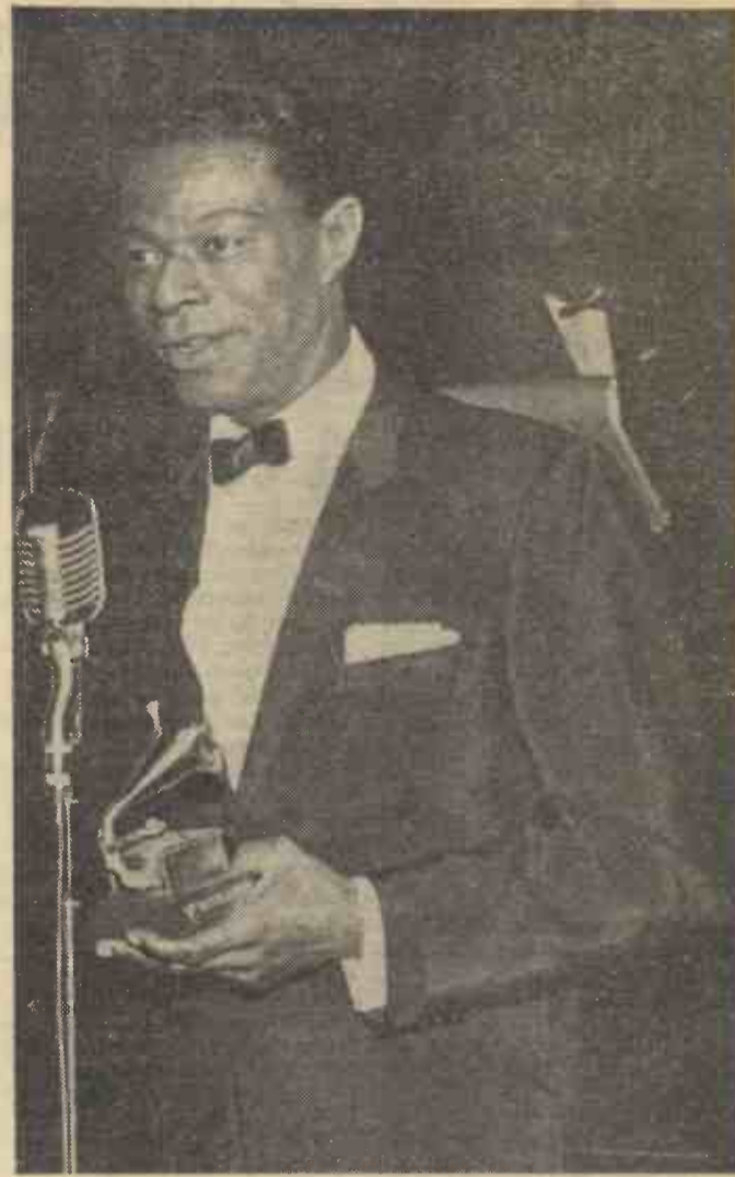
NAT KING COLE: A thoroughly charming gentleman, as you will discover if you are fortunate enough to meet him on his forthcoming tour. Above he is pictured with one of his countless awards.

And what I say is: "You're more than welcome, Your Majesty."