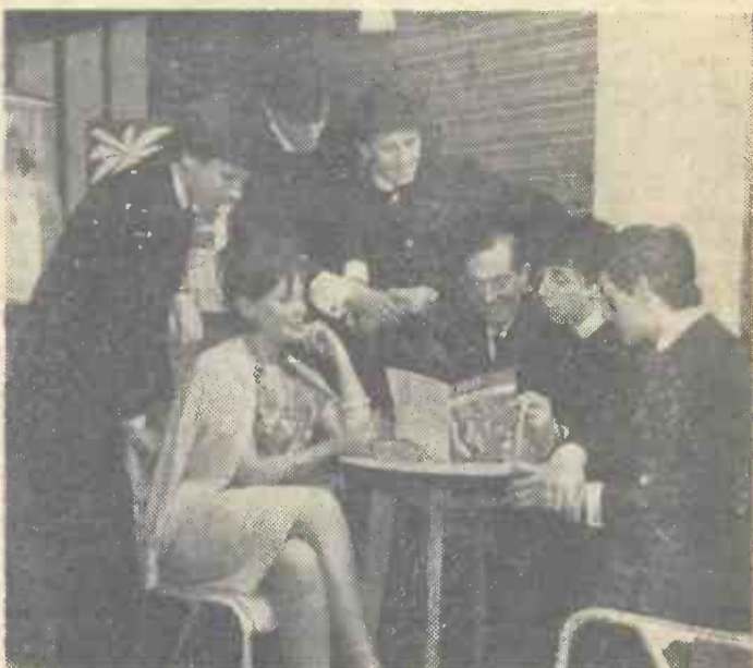
Our hosts THE HOLLIES, pictured with the owner of the fabulous OASIS and his wife. Looks like a planning conference going on.

The list of the groups carries on. And all of them play at the Oasis, which is Manchester's equivalent to the Cavern, a Dance-Hall cum Coffee Bar, they even produce their own magazine to cater for the Manchester beat scene. The Hollies, together with Freddie and The Dreamers are strong favourites there where discs are also played. Gimmicky groups also exist on