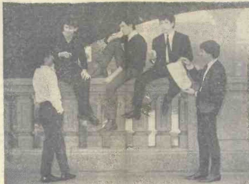
Another shot of the HOLLIES, this time on a bridge over the famous MERSEY—but at the Manchester end! The boys seem to be contemplating their current success, or else working out a follow-up number!