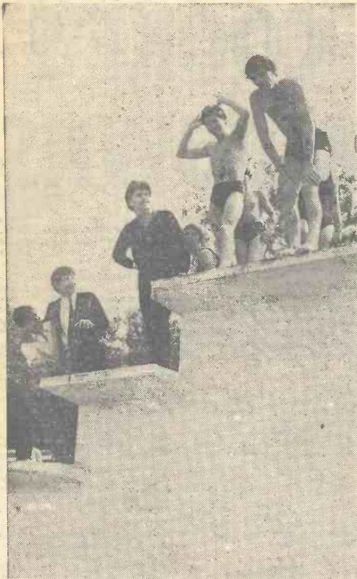
The HOLLIES, currently riding high in the charts, are pictured high above a hometown swimming pool. But there should be no "diving in at the deep end" for them now that success is theirs.