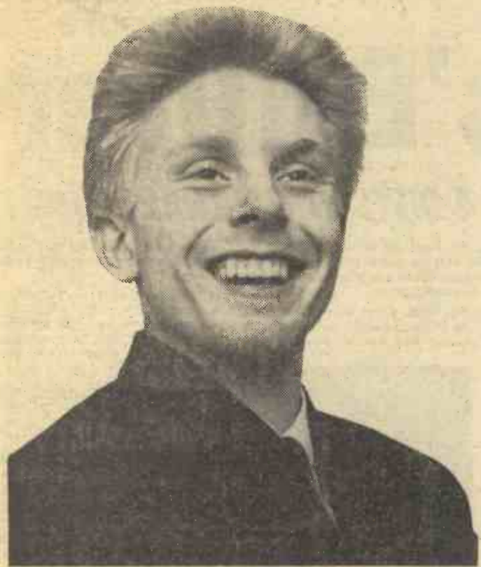
A cheery grin from pop star JOE BROWN whose latest is tipped for the top.