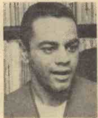
MATHIS — A hit?