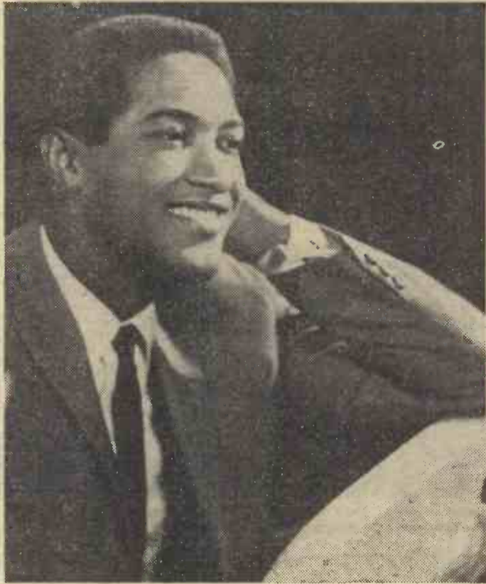
SAM COOKE back in the charts again. He is an unpredictable best-seller here—but automatically clicks in America.