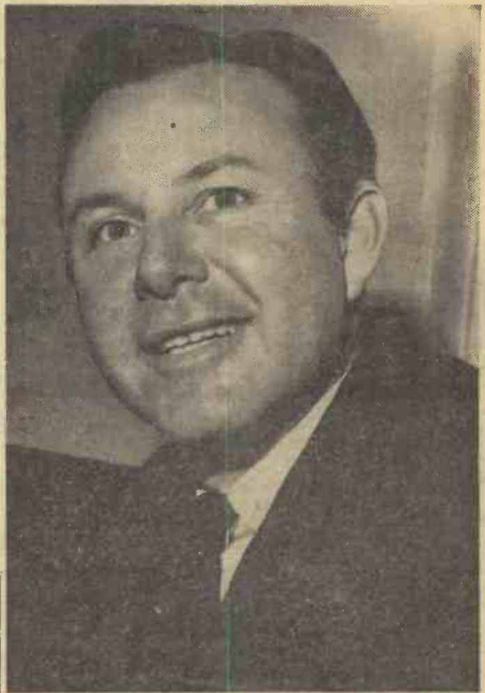
JIM REEVES: He cannot sing for his British fans but he is appearing at American military bases during his trip.

Even if so many other things in his life have been left to old Lady Luck, via a toss of a coin.