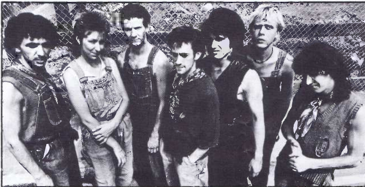
Top Single: Dexy's Midnight Runners