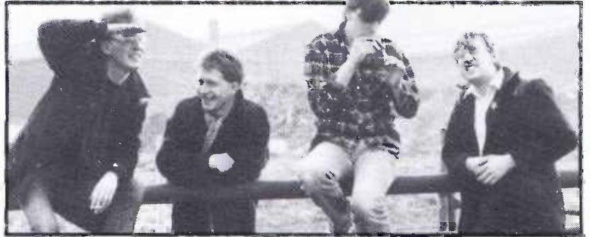
Farmer's Boys — outstanding single.

Finally, independent music has reached a landmark of sorts in the last month of 1982. Hollywood Records' 'Save Your Love' by Renee and Renato, described by the label as a 'joke' record