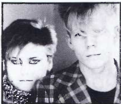
Yazoo: Two in Top 15