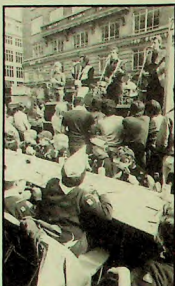
MAGNETIC RECORDS stars Matchbox was a feature of the longest street party of the royal wedding, to celebrate 'Love's Made A Fool Of You' charting. The band is seen playing outside Selfridges in Oxford Street, London, to hundreds of fans.