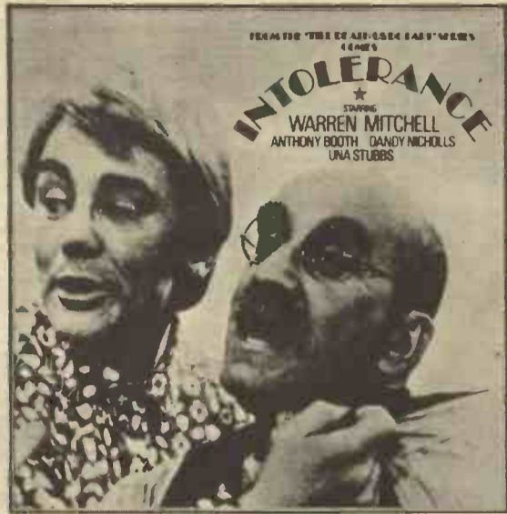
INTOLERANCE NEP 24283