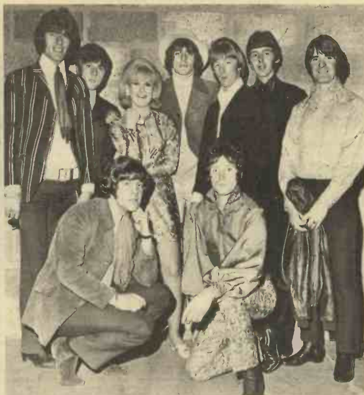
DAVE DEE, DOZY, BEAKY, MICK and TICH met up with DUSTY SPRINGFIELD and three of the PROCOL HARUM at "Top Of The Pops."