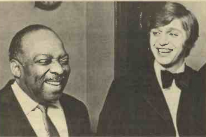
Great moment for GEORGIE FAME, appearing with COUNT BASIE at London's Albert Hall. Georgie was in great form, backed by the famous orchestra. Standout songs were "Three Blind Mice," "Lovey Dovey" and "Lil' Pony."