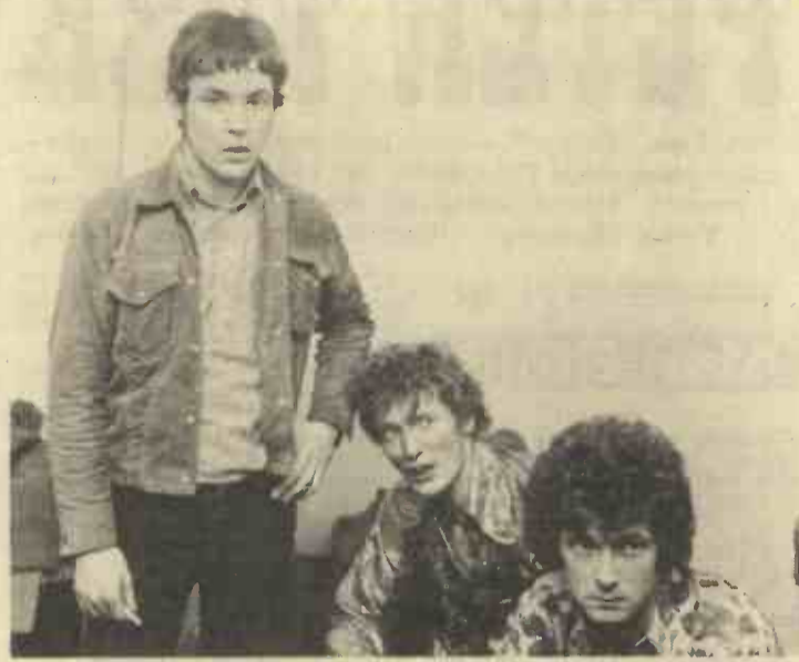
The CREAM, who look set for another hit with "Strange Brew." (L to r) JACK BRUCE, GINGER BAKER and ERIC CLAPTON.