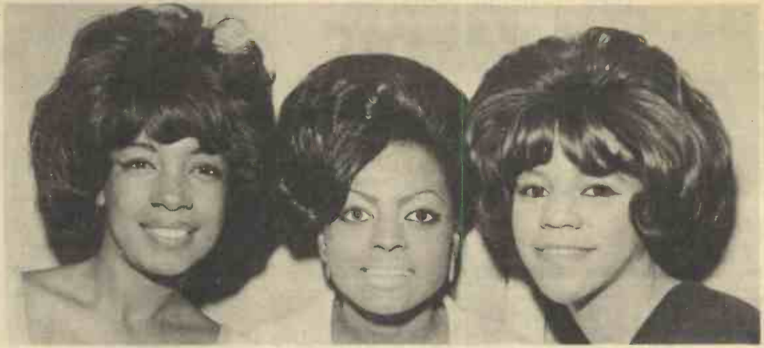
SUPREMES (l to r) MARY WILSON, DIANA ROSS and FLORENCE BALLARD.

"It's not right. It's wrong! Very wrong!" he stormed over the transatlantic wire. "Someone is trying to louse up the act. It makes more money than any other female act in the world and someone doesn't like that. The hint they'd break up has forced us to cable bookers all over the world. The girls are working till 1968 solid."