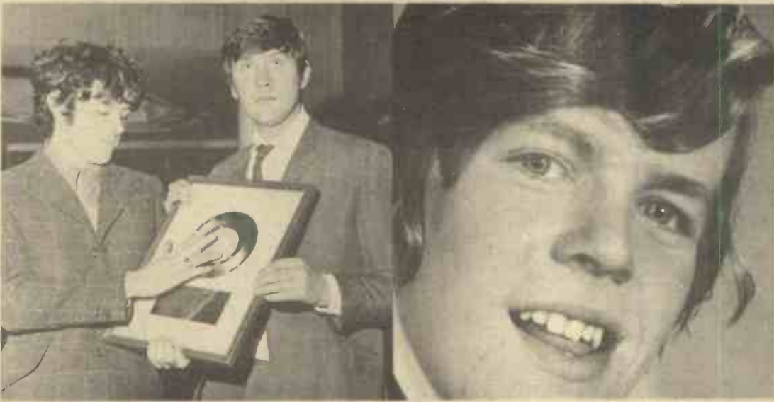
Above: MICKIE MOST, who in four years has made a fortune from making hits, with DUNOVAN. Centre: HERMAN, who relies completely on Mickie's advice. Right: LULU went without hits for some time until Mickie took over her recording. She's a great talent, he says.

Then he thought a moment, and said: "Okay—the Animals' 'Baby Let Me Take You Home', 'House Of The Rising Sun', 'Don't Let Me Be Misunderstood', 'Bring It On Home To Me', 'Got To Get Outa This Place', 'It's My Life', 'Boom Boom' (in the U.S.), the Nashville Teens' 'Tobacco Road' and 'Google Eye', Brenda Lee's 'Is It True' . . . Herman's 'I'm Into Something Good', 'Show Me Girls', 'Silhouettes', 'Wonderful World', 'Just A Little Bit Better', 'Mrs. Brown You've Got A Lovely Daughter', 'Listen People', 'Must To Avoid', 'You Won't Be Leaving', 'This Door Swings Both Ways', another one I can't remember, 'No Milk Today', 'Dandy', 'East West', 'There's A Kind Of Hush' . . . the new Lulu, the new Jeff Beck, the Yardbirds' (a big one in