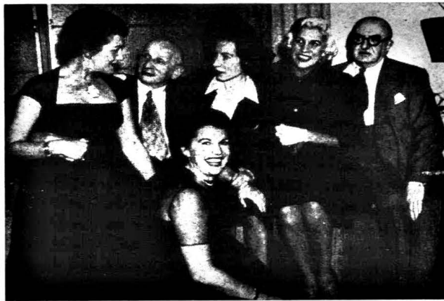
These exclusive pictures show the Andrews Sisters entertaining visitors in their dressing-room last Saturday. The top picture shows the three famous sisters together with the three British girls, the Beverly Sisters, who have been having great success in their cabaret and variety appearances.