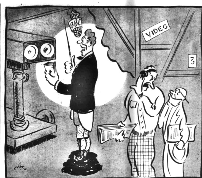
"Blimy... d'you realise the camera is going to track back when he says 'I've got nothing up my sleeves!'"