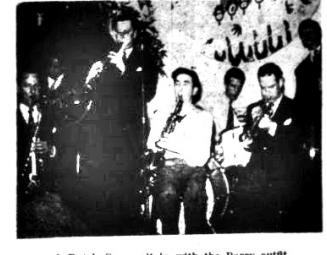
A Dutch Grot set in with the Farry outfit.