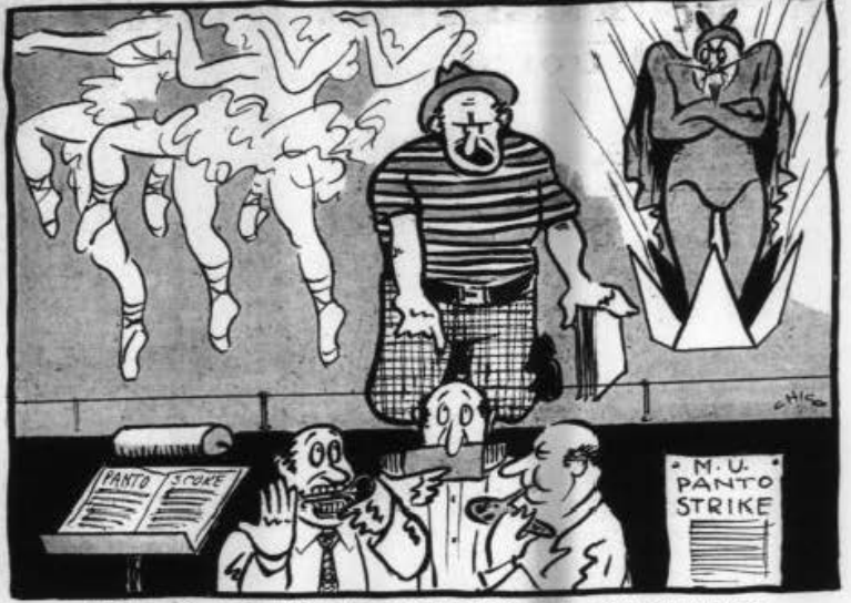
"When the Demon King shoots through the trap, gimme a big bass SFORZANDO on the comb and paper with a GLISSANDO on the jaws harp!"

Huddle Ledbetter Becky Deans, she was a gambler gal Fig Meats Papa Tempo R.I.I. Four Day Worry Blues New Black Snake Moan Tempo R.I.I. (Now 7/6 each.) While we are on this festive righteous tack, let me add a 12-string guitar and folk singer Huddle Ledbetter, who has facility as his unwieldy instrument as Anton Yonkno-who for six. Personally I find his songs fascinating, but the same way that one is fascinated by an antique first floor or an antique's diary. For a variety of reasons Ledbetter's words are mostly unimpressive, but there are a great - grandmother's handwriting, and her journal is no less interesting for that. One of the most striking things about the songs is the traditional 8- and 10-bar phrasing which has been in the band for so many astounding years. "Fig Meats Papa," a formal blues, is stretched as