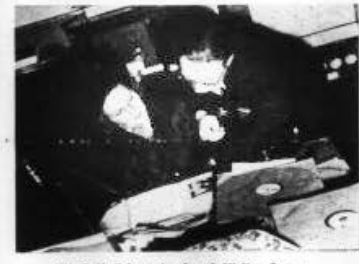
Elizabeth Schwarzkopf and Walter Legge.