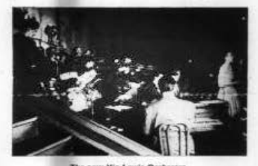
The new Vic Lewis Orchestra