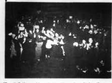
The staff thoroughly enjoying themselves during the dancing.