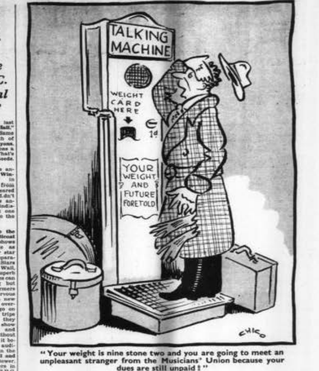
Your weight is nine stone two and you are going to meet an unpleasant stranger from the Musicians' Union because your dues are still unpaid!

Notice. New address and phone number of Musical Express: 38, STORE STREET, LONDON, W.C.1 LANGHAM 5410