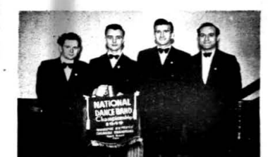
CHESHIRE: (Small Band) Down Beat Swingette of Warrington.