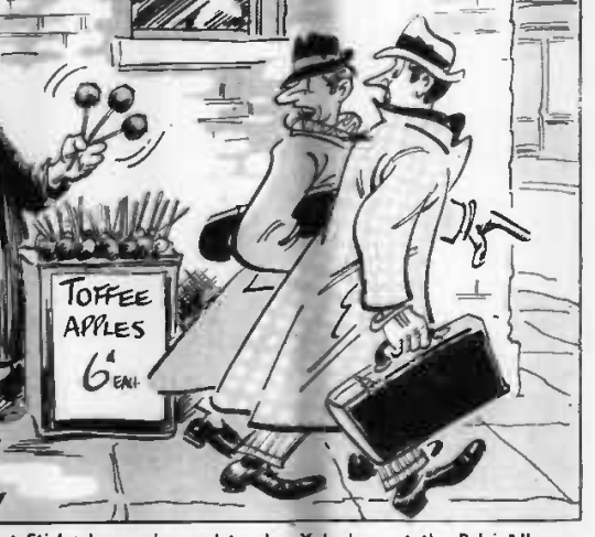
"Say... isn't that Sticky Jones who used to play Xylophone at the Palais?"