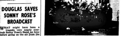
Ferry Como is shown in this exclusive picture from America, making his first recording with an orchestra after the lifting of the ban. Conducting the orchestra is Henry Rene.