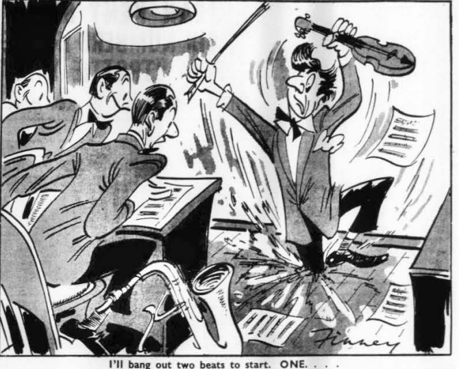
Artie Shaw and his Orchestra The Pied Piper of Hamelin