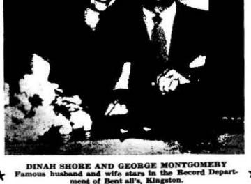
Famous husband and wife stars in the Record Department of Best All's, Kingston.