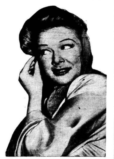
BETTY HUTTON ("Platinum Screwball", "Bouncing Betty")