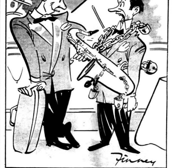
"With all the instruments that have been pinched lately, I'm not taking any chances!"