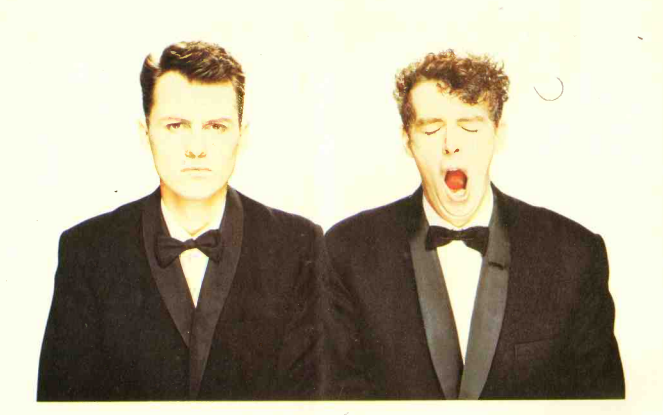
Album. Cassette. Compact disc.