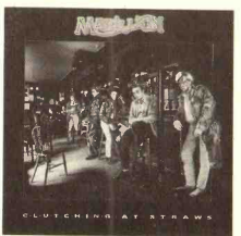
Marillion - Clutching At Straws - EMI