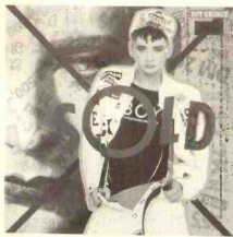
Boy George - Sold - Virgin