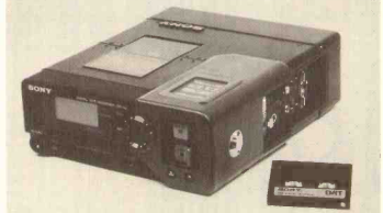
An example of Sony's DAT.

duce machines that can only record at a 48kHz sampling rate. It would stop a direct-digital (DD) transfer of CD, which uses 44.1kHz sampling; but would not prevent DAD (digital via analogue to digital) recording. The other reason is that at least two manufacturers, Sharp and Hitachi, have already shown consumer DAT players that can record at CD's 44.1kHz.