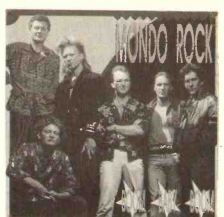
Mondo Rock - Boom Baby Boom - Polydor