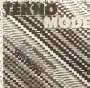
LEO WASHINGTON Tekno Mode