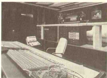
Dierks Studio 3.

So when you older, more experienced studio colleagues complain about the shortcomings of digital and the audible benefits of analogue, don't simply dismiss what they say as rubbish; listen for yourself. Perform comparison tests. And when you agree that there's something wrong, press studio managers and the industry at large to do something about it.