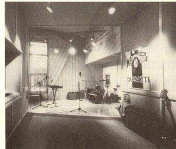
Sonet's 40 sqm Music Studio 2.