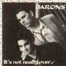
BARONS It's Not Really Over

DISCHI RICORDI - Via Berchet 2 - 20121 Milano (Italy) - tl. 8881 - tx 310177 RICOR I