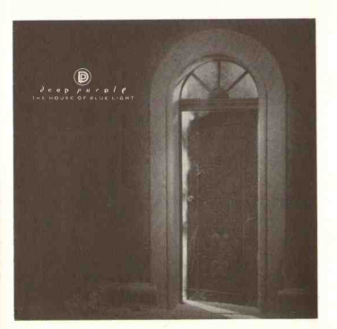
The House Of Blue Light' inspired by the legendary 'In Rock' album is released this month.

'Machine Head' and the extremely successful double lp 'Live In Japan', things started to go wrong for Deep Purple. There were many disagreements within the group and the expectations," says Gillan, "it was pressure eventually caused a break-