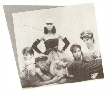
Berlin- Currently shooting up the European Airplay top 50 with the love theme of Top Gun, Take My Breath Away,