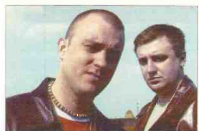
by Aleksey Kruzin

With the release of their new single, the follow-up to last December's hit ResuRection, Russian dance act PPK have, for the first time, been heartily embraced by the local media.