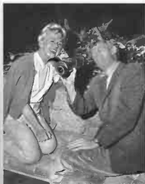
Doris Day and Richard Widmark enjoy a joke together off the set of Tamara of Lova

A new career had been born. Doris successfully combined her singing talent with her acting ability until she made her first serious dramatic film titled Storm Warning . She has since done splendid work on the screen.