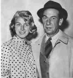
Rosemary with her actor-producer husband, Jose Ferrer

Rosemary was born on May 23, 1928. Her father was a house painter in Maysville,