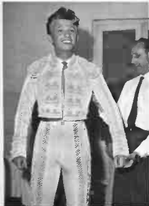
As seen in British Picture Corp.

You never know what he is going to do. If you arrange to meet him for an appointment he may turn up half an hour late or