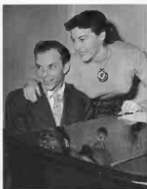
Frank sings a duet with glamorous Ava Gardner

A lucky break came when Columbia contacted him and offered to give him a test provided he pay his expenses back to Cali-