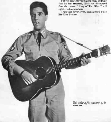
Elvis makes a big come-back in the film world and is welcomed by his many fans

There has never, ever, been anyone quite like Elvis Presley. . . .