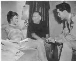
Producer Hal Wallis chats to Elvis and Juliet Prowse during the making of G.I. Blues Below: Elvis catches up on the news

His records sold in fantastic numbers and his recording of "Love Me Tender" which was the title of his first film, sold a million copies as advance orders before it was on sale in the record store. Such was the amazing