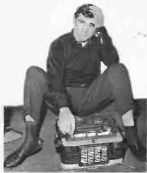
Tony can play an instrument—the tape recorder!

thirteen years later I'm 'found' again."