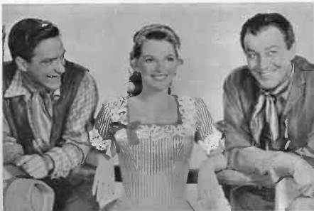
John Cassavetes and Robert Taylor with Julie London as they appear in M.G.M.'s Saddle the Wind