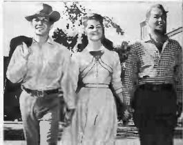
Frankie's first venture into the film world was in Guns of the Timberland with Alan Ladd and her famous father

His natural charm and talent has taken Frankie Avalon to one of the loftiest positions in show business.