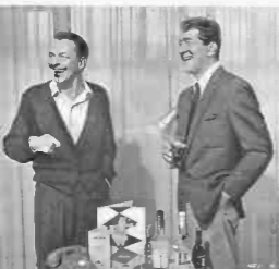
Frank and Dean Martin share a joke during a break in the shooting of Ocean's 11

loved him. Sinatra went on to a more sophisticated, swinging kick and teamed up with Billy May, and then a fellow named Nelson Riddle. Together they made sweet music and Frankie's long playing albums chalked up amazing sales.