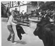
As seen in British Picture Corp.