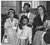
Nat with his wife and two daughters, Natalie and Carole bound for Monaco

Neither have millions of other people. The voice of Nat King Cole will never fade away.