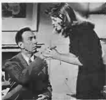
Julie and Jose Ferrer in U.S. The Great Man