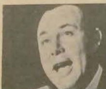
REEVES: all-time great