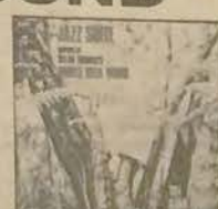
THE STAN TRACEY QUARTET Jazz: Suite Columbia: 60X3989