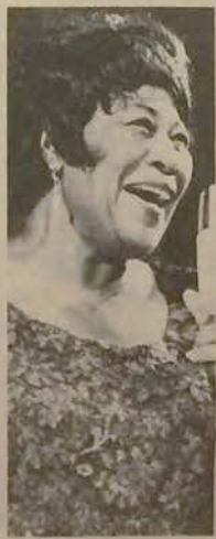
ELLA: one of her best

BILLIE HOLIDAY: "The Voice Of Jazz" (Verve VSP 3738). Two albums of tracks recorded between 1954 and 1957 with the late, great Billie backed by such musicians as Harry Edison, Willie Smith, Barney Kessel, Benny Carter, Charlie Shavers and Paul Quinichette.