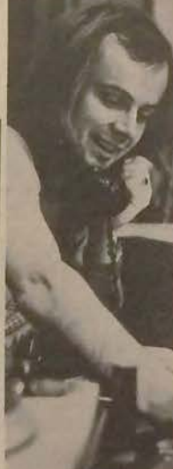
PEEL: no profit

SOLE REPRESENTATION THE ROBERT STINGWOOD ORGANISATION 47 BROOK ST. W.1. MAY 9121