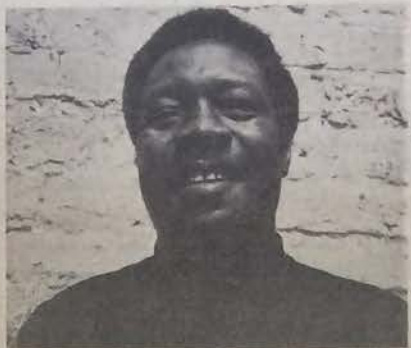
OTIS SPANN is just one of the many artists scheduled to appear on the Melody Maker's American Folk, Blues and Gospel Festival

BILLY PRESTON's first LP for Apple will be out on August 22. Titled "That's The Way God Planned It," it includes a Bob Dylan composition, "She Belongs To Me," W. C. Handy's "Morning Star..."