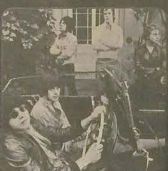
2 THE LOVE AFFAIR BRINGING ON BACK THE GOOD TIMES 4300