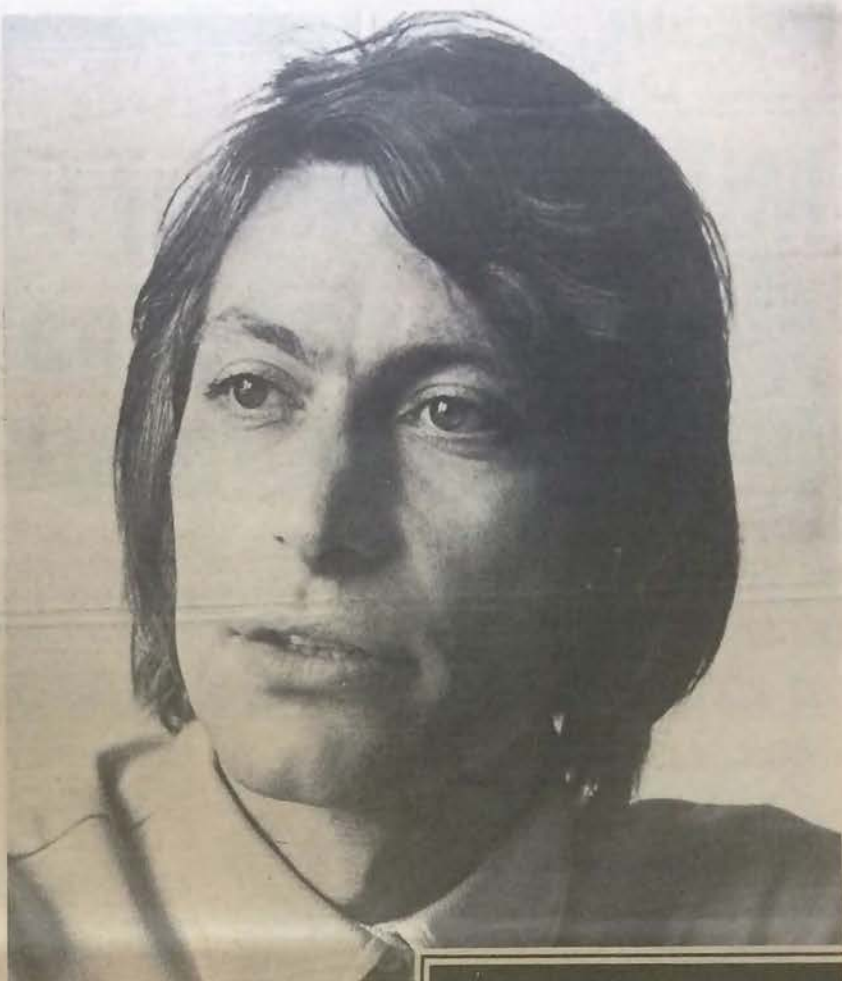
CHARLIE: blunt but never pretentious

"I hope it will be shown. Everything is finished. The thing was everybody in it was good, but we didn't like our bits. It wasn't filmed as well as we wanted because we were at it all day and the film crews were tired by the time