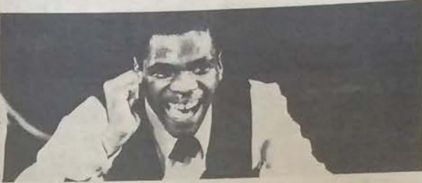
PRESTON: 'there's no trouble, everything's cool'

The music may change; hair may be long or may be short; but rumours on everything and anything will fly from Denmark Street to Fleet Street and back again via Mayfair, Belgravia and even Chelsea.