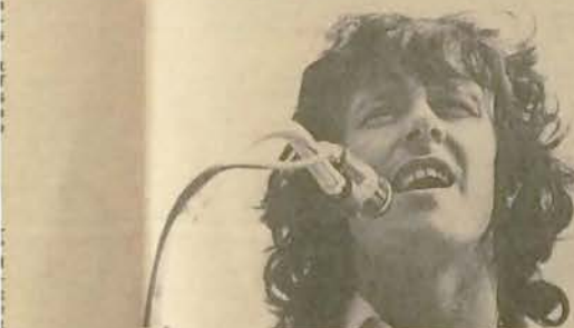
DONOVAN: 'We are going to try the electric Donovan'

stay acoustic. "It should give my work a lift, I feel I could figure higher in the chart if I had friendly, tighter musicians with me rather than going into a studio and using session musicians. When the musicians are right it gives a song much more life and you can record at home or wherever you like. Like Pete Townshend's thing—that was made at his house which is why it's so alive and tight and good."