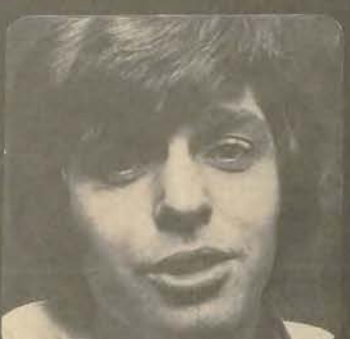
1 GEORGIE FAME PEACEFUL 4295