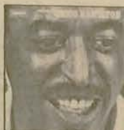
CHICO HAMILTON The Best Of Chico Hamilton Impulse: MIP/L/SPL517