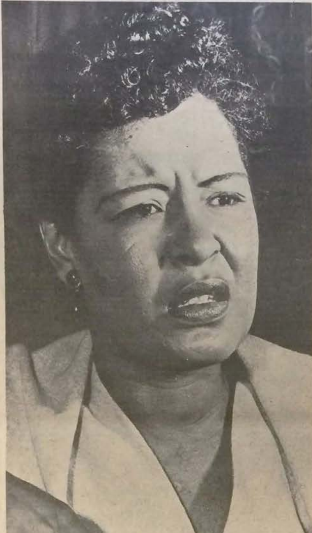
BILLIE: the essence of jazz