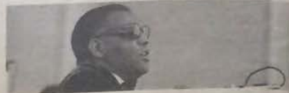
RAY CHARLES: opening date

Lulu opens this Sunday in colour at La Dolce Vita, Birmingham. She is already in line for a new BBC TV series in the new year.