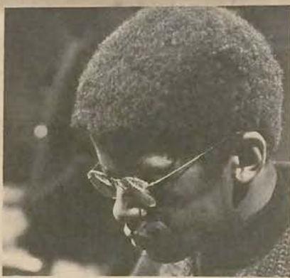
HILL: a consistently original pianist

Second to be issued was "Judgement" (BST 84159), again a quartet and a new ap-