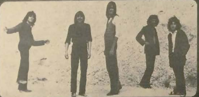
4 FLEETWOOD MAC NEED YOUR LOVE SO BAD 57-3157