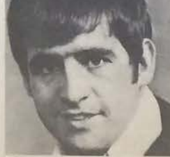
DOLAN: a household name in Ireland.

Joe, who made the MM Chart last week with "Make Me An Island," has for the past few years been racking up a string of hits in the Irish chart, with his group the Drifters, and has become a household word as far as pop music is concerned in Ireland.