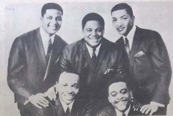
MOVING up the MM Pop 30 this week with "I Can Sing A Rainbow" are The Dells , five singers from Chicago who have been together for fifteen years.

Crudup , mentioned by Elvis Presley as one of his early influences, will be here either in the late autumn or spring next year. Bonner is due in November for a four-week tour and McDowell is expected in January next year. All the tours are arranged by the National Blues Federation .