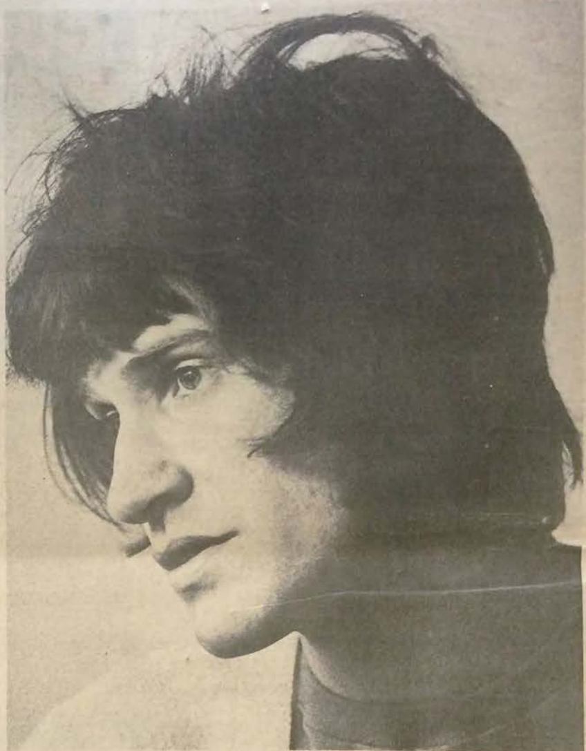
RAY DAVIES: the greatest song-writer we have, says an MM reader