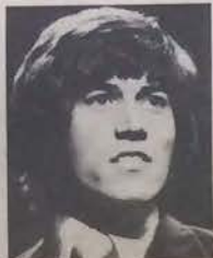
BEE GEES filming soon