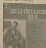
LOUIS ARMSTRONG Louis & The Big Bands 1928-30 Parlophone: PMC7076