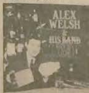
ALEX WELSH Alex Welsh & His Band '69 Columbia: 62/60X3323