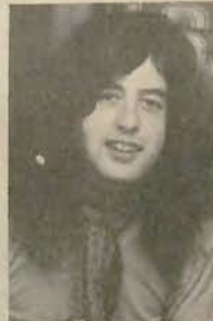
PAGE: own style