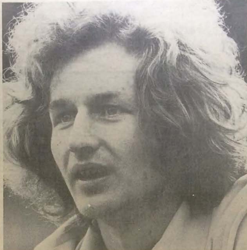
RICK GRECH: 'Sure—I was nervous at first'

"She is holding a model spaceship and she is sup- posed to be representing the contrast between purity and innocence and the great scientific progress of the day. In America I suppose they take it as a phallic symbol. In my opinion, the whole of New York is a