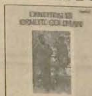
ORNETTE COLEMAN Ornette At 12 Impulse: MIP/L/SPL518