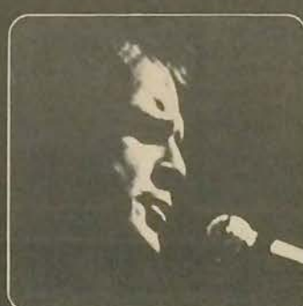
3 TIM HARDIN SIMPLE SONG OF FREEDOM 4441