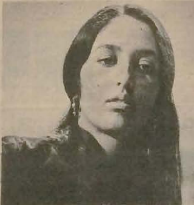
JOAN BAEZ a timeless voice

Tricks Of Time" (Otra 1078). Another selection of original songs from Matt. Some good, some indifferent but all bearing the unmistakable McGinn stamp. Included on this album are "Jolly Red Nose," "The Man In The Moon" and "The Witches Song."