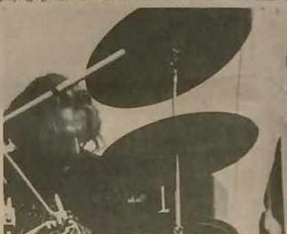
GINGER BAKER AND ERIC CLAPTON

"We want to record in the Atlantic studios when we go back to the States and I am writing some songs for the next album. When I joined the band, I wasn't too confident about