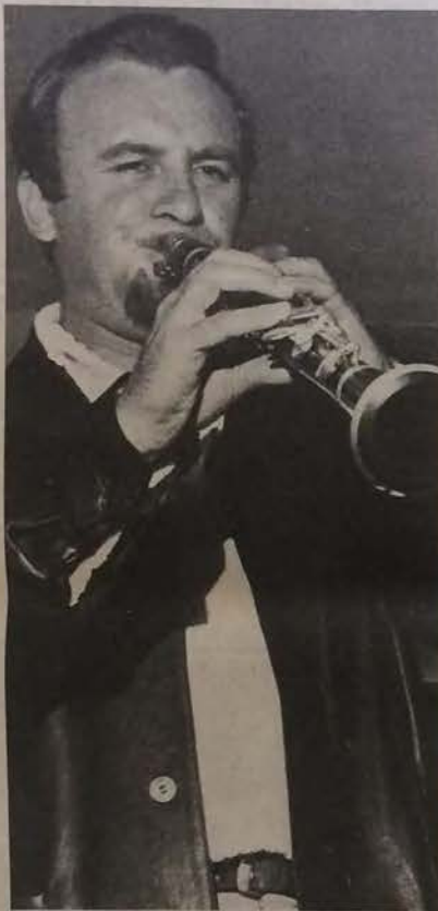
ACKER: 'passports are full up, man'

in Soho, where I often meet Acker. The club is part of the Bilk empire and, as he explained, if a fellow's going to take some refreshment he may as well put a bit of the profit on it back in his pocket.