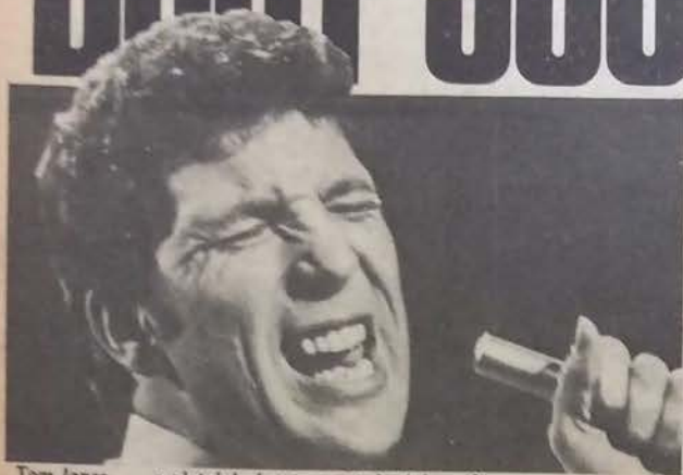
Tom Jones... a plateful of curry goat, rice 'n' peas?

"I SAW this white British singer, Petula Clark, on television and she was singing her tune 'Downtown,' the tune she made it on. Like, it was very humorous because she was screaming and she was trying to look composed at the same time."