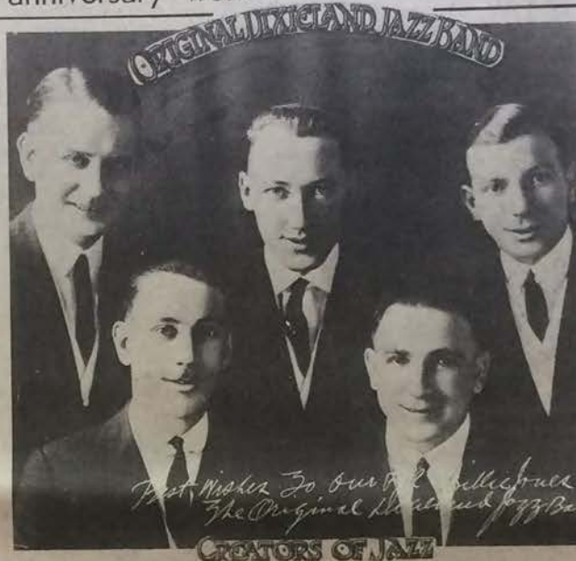
The ODJB played at the Gala Opening on November 28, 1919

Novelty dances like the Charleston and Black Bottom had brought dancing into disrepute, and at-