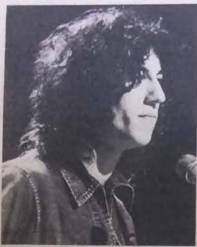
FLEETWOOD MAC: among the top names