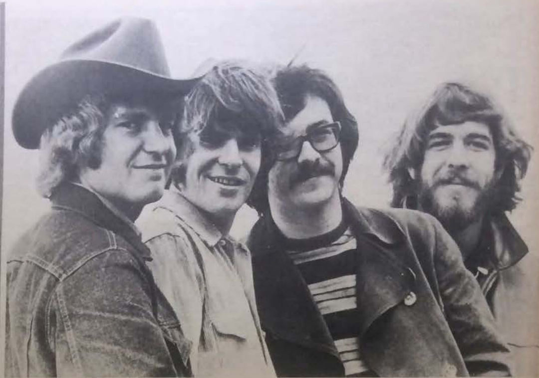
CREEDENCE CLEARWATER REVIVAL: waited ten years for a hit.