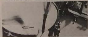
HEADMASTER Plastic Drum Heads

Uplight for a better sound? You had better believe it! Listen. These heads are impervious, unaffected by changes of temperature. Do not require constant retensioning. Their life is almost indefinite if handled with care! It's a fact, man! Hit 'em, kiss 'em, murder 'em. . . these heads are impervious!