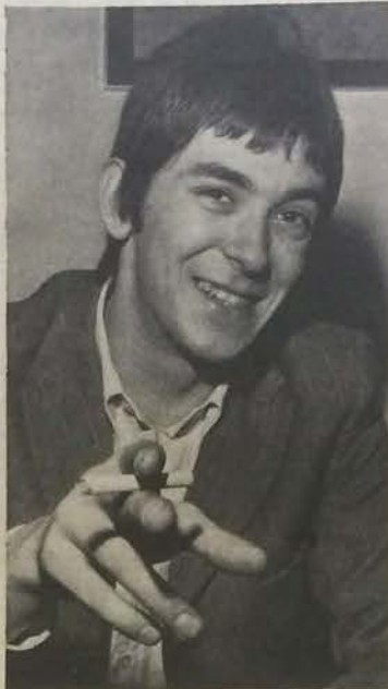
IAN MCLAGAN: 'I'm not really broke'

The remaining Faces don't want to be Faces anymore. They started in 1965 with great rocking hits like "Whatcha Gonna Do About It" and quickly gained a mod image, when mod meant Carnaby Street and long hair, and not a new Hitler Youth.