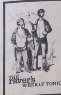
THE RAVER'S WEEKLY TONIC