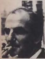
RONNIE SCOTT TV series in jeopardy

A MUSICIANS' Union TV ban that has already hit American pop groups due to star on Top Of The Pops could jeopardise a series of TV jazz shows planned for the autumn.