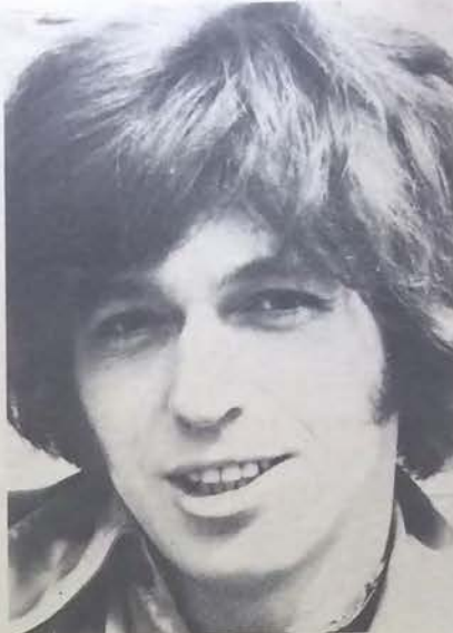
GEORGIE FAME: a warm and summery sound

This is the most obvious single from the LP and should have been released