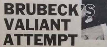
BRUBECK: top form