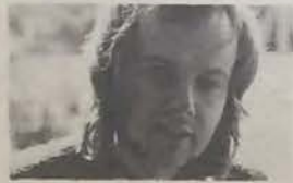
JOHN PEEL last year's top DJ

OVER THE past 12 months, one deejay has emerged head and shoulders above the rest in influence, popularity and integrity. John Peel's year as perhaps the most respected deejay in the popular music business started when he was voted Top Disc Jockey in the Melody Maker Pop Poll.