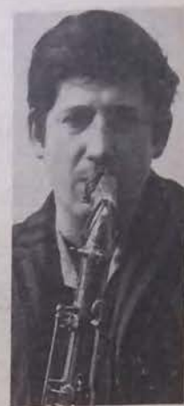
MORRISSEY jazz for fun