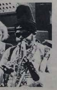
KIRK: last night