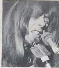
JOHN MAYALL U.S. impressions

This was on the Thursday and as far as New York was concerned, Friday and Saturday were the big dates to happen—the Fillmore, famous for its big name programmes, was putting on a really heavy show, as far as the public was concerned and it proved to be a smash hit sellout that they are still talking about. Slim Harpo opened, me next and Ten Years After closed.