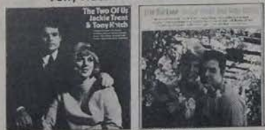
The Two Of Us N.S.P. 1829 (S) N.S.P. 1829 (S)