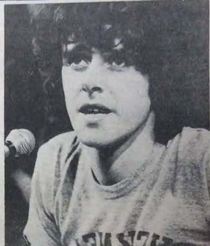
DOVONAN: penny whistle and guitar