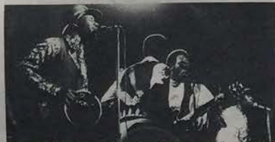
CHAMBERS BROTHERS: gig at the Fillmore

F OUR brothers from Mississippi and a Yorkshirer, who played with Manfred Mann, met in New York and combined to form one of the most interesting groups to come out of America.