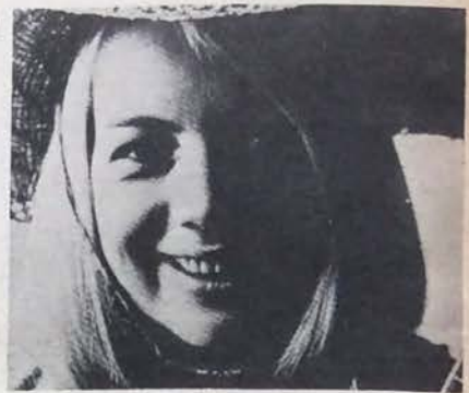
SAFFRON: 'I've achieved something'

"I like playing anywhere out of London, in clubs, but for doing concerts, I think the London audiences are more progressive. I don't alter my