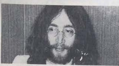
JOHN LENNON: still in Amsterdam

The Beatles are not expected to resume recording sessions on their new album until Ringo Starr finishes filming the Magic Christian with Peter Sellers in about five weeks.