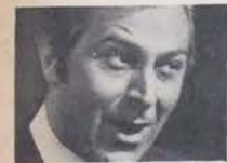
O'CONNOR Up tempo number