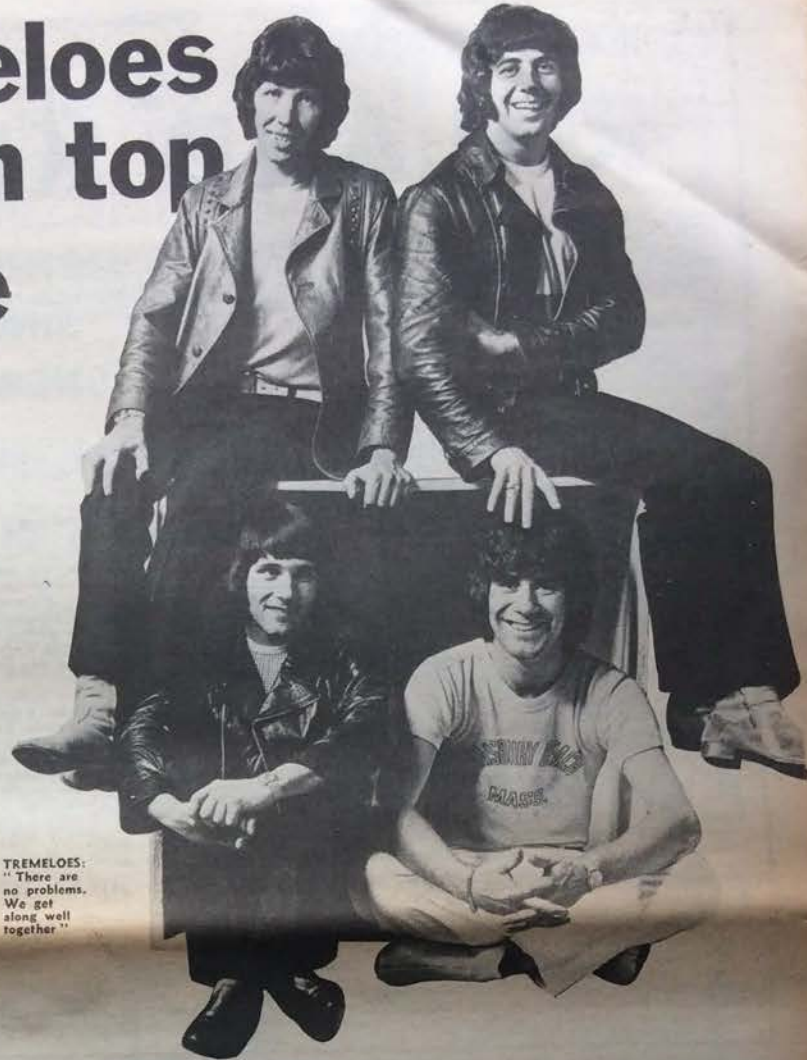
TREMELOES: "There are no problems. We get along well together"