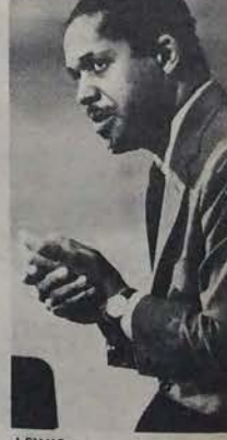
LEWIS new music

"Our programme is so diversified it represents all of our styles. When we play Jack-soon's 'Nirvana' or some of our blues, I believe we swing as hard as any group—if hard swing is what you're looking for." "But with the Quartet, the audience can't expect to be entertained totally. Not easily, anyway. They have to give a little, too, and involve themselves in the music." "It's always been that way in the classical field, for instance. You have to join with the musicians in making an effort. It's a reciprocal thing, really, but some people are just too lazy to do that." "I know with our concert, when everything's right, something happens on the stage when you know you have everybody in the place listening to you, receiving what you're doing and sending back reciprocal vibrations. That is your reward."