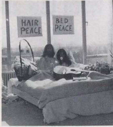
JOHN LENNON and Yoko protest against war and violence by staying in bed. Mind you, this form of protest isn't cheap. They chose to air their principles for seven days at the Amsterdam Hilton in a flower-bedecked £20-a-day suite. Never mind, for those who can't afford that, there's always a sleeping bag in Hyde Park.