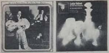
Downbeat With Tony Hatch The Tony Hatch Sound The Tony Hatch Sound The Tony Hatch Sound