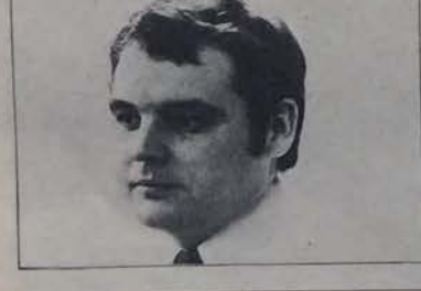
KIRK: last night