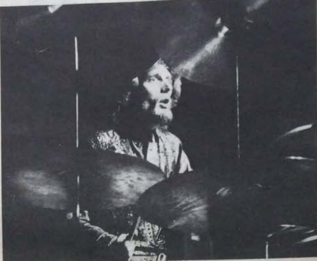
GINGER BAKER: one of the old firm

CREAM: "Badge" (Polydor). One hesitates to use "heavy" as an adjective having uttered it approximately two dozen times in the last fortnight to describe everything from Spooky Tooth to the pressure seemingly exerted on my frontal lobe following excessive addiction to wines and spirits of varying quality.