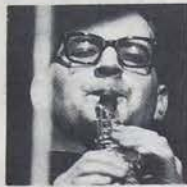
HECKSTALL-SMITH playing experience