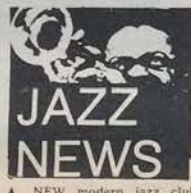
A NEW modern jazz club opens on Tuesday (8) at the Albion, opposite London's Olympia.

GUITARIST Gabor Szabo was injured and robbed when three men accosted him during his San Francisco engagement. He was beaten and stabbed and robbed of 300 dollars. His injuries however were moderate and he returned to work the following evening. At the end of his engagement, he returned to his Los Angeles home to recuperate.