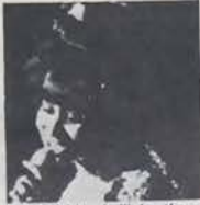
ARETHA: she'll be there for only 33 gns.

The MM will take you by coach to Antibes for a 10-day holiday offering bed and breakfast accommodation at a modern hotel like the Pacific, used by many satisfied readers last year.