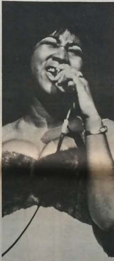
ARETHA: soaring vocal power