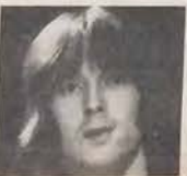
CLAPTON Continental tour