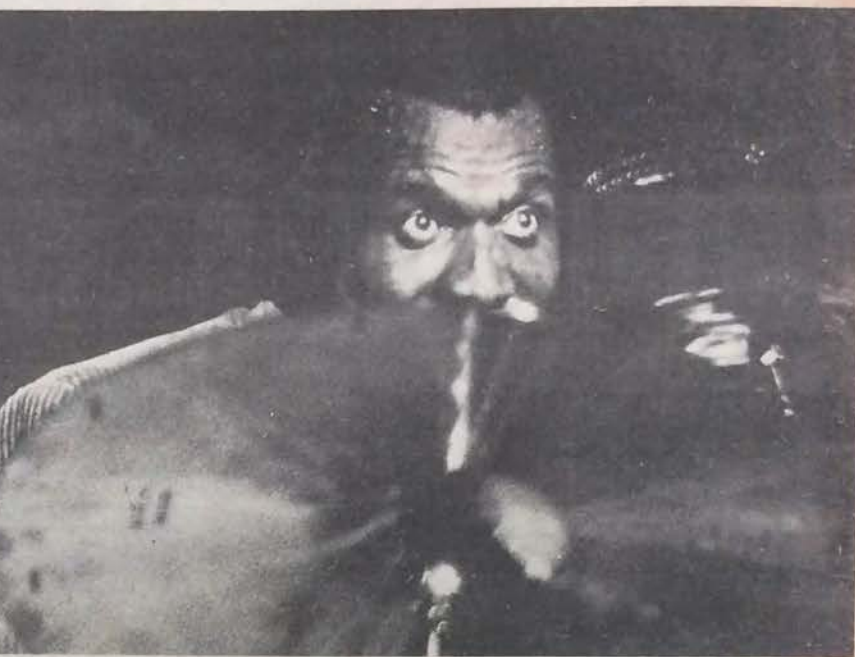
ELVIN JONES: a great jazz drummer?

In recent years many musicians, including Basie, Ellington, and Cannonball Adderly