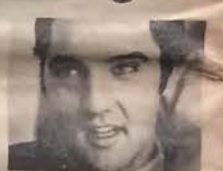
STEVIE WINWOOD: greatest?

THE greatest ever white blues group consisted of three unique swingers — Elvis Presley, Scotty Moore and the late Bill Black. They achieved the greatest white blues sound with vocal, electric guitar and string bass. No electronic garbage was needed. — T. NEALE, London, W2.