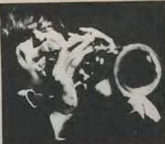
JOHN SURMAN 'a fair idea of how much I don't know'

"I would prefer to just go to the States and listen. Dave Holland would put me up. This is where my education lies at the moment. I've