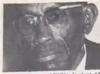
LEWIS: dead at 68

CLARINETTIST George Lewis, probably the best loved of all the contemporary New Orleans jazzmen who stayed at home when Jazz travelled north, died of pneumonia and Hong Kong flu in a Crescent City hospital on December 31. He was 68.