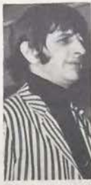
RINGO: Beatles best

Charley Pride arrives in Europe on February 21 for