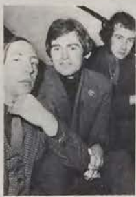
SCAFFOLD very, very funny

the show. Black Cat Bones, a five-piece electric band, played a nice, together set.