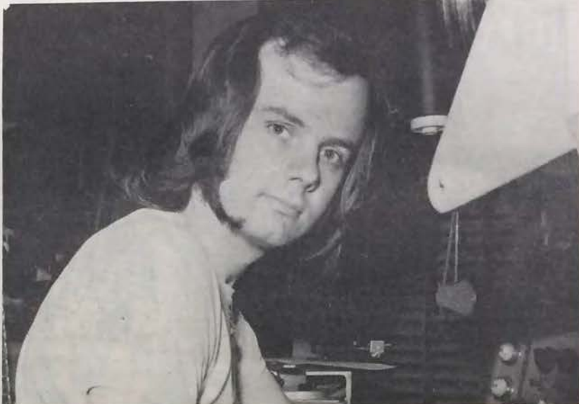
London's Brunel University carry out a simple booking policy. 'We book anyone John Peel (above) likes.