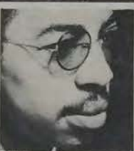
TONY WILLIAMS leaving Miles Quintet?