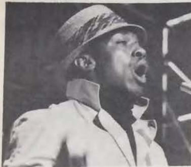
STARR: a rare case