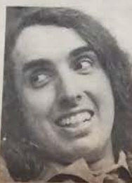
TINY TIM: publicity

IT'S a shame that a talented group like the Hollies are so badly underrated. They have given us a great selection of hits, have always come up with new, fresh material.