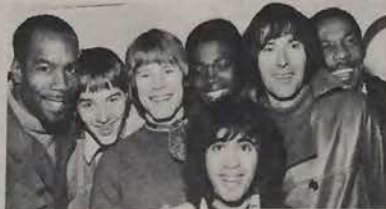
FOUNDATIONS: 'a sort of jam session'

The Foundations are writing a lot of material now and this has brought problems. "Most of my spare time