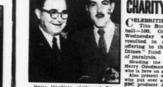
Benny Goodman (left) and Benny G's Brothers.