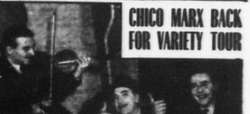
CHICO MARX BACK FOR VARIETY TOUR