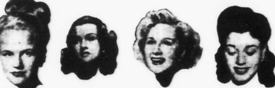
Peggy Lee Jo Stafford Margaret Whiting Kay Starr

PEGGY LEE... Long Train with a Red Caboose... Captain... (AM, Capitol 276)