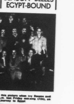
The Benson Belles were there to take this picture when they...