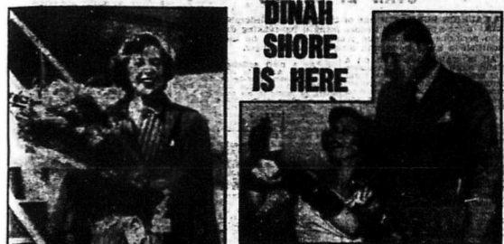
DINAH SHORE IS HERE