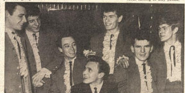
THE GAMBLERS from Newcastle-Tyne are Billy Fury's new backing group—and they're already out some "top secret" sides with the star.