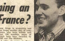
BILLY FURY—How about a top of the Palladium spot? See "What About Billy?"

Every week the writer of the best letter gets an LP of his or her choice, and once a month there is a bonus prize of a Remco lighter-ashtray set!