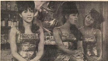
It was parties all the way during the Ronettes' tour here.

"I know clothes are very expensive in Paris," said Ronnie. "But that's not going to stop us."