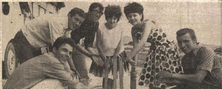
See, and had a break in filming, so what better than a game of cricket with The Shadows.