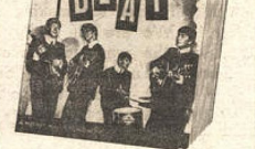
Big Beat Boys... the inside drama behind the most exciting sounds ever to hit British records!