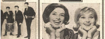
MPANY LTD DECCA HOUSE ALBERT EMBANKMENT LONDON E81