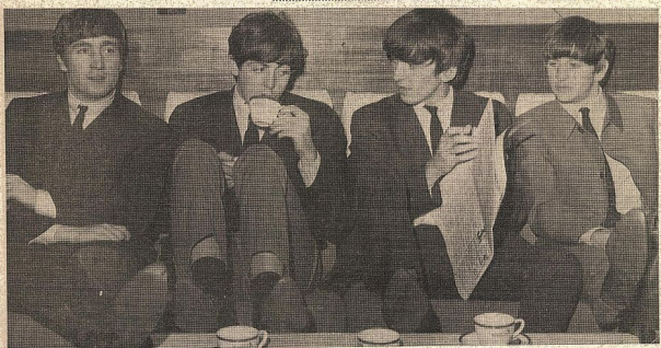
In spite of all that's happening in America The BEATLES can still manage to relax!

T HOSE fabulous Beatles have made chart history yet again — this time in America! According to the current issue of the trade paper "Cash Box" they have no less than SIX records in the Hot Hundred, including "My Bonnie" which they cut in Germany for Polydor with Tony Sheridan more than two years ago, when the group consisted of John, Paul, George, Pete Best instead of Ringo, and the late Stewart Sutcliffe.