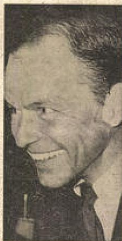
FRANK SINATRA—ill streets ahead of the field.