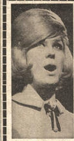
DUSTY SPRINGFIELD —trouble with her throat.

Graham Nash (guitar and vocals) Born Blackpool, February 2, 1942, and played in groups with school pal Allan Clarke at 15. Musical tastes: classical guitar, Likes guitarist Charlie Byrd and John Williams—also The Rolling Stones and the original Big Three and the comedy of Freddie and The Dreamers. Film and film stars: good horror films like "Psycho", Peter Sellers, Anthony Perkins, Susan Hayward.