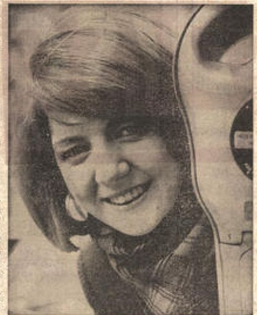
CILLA BLACK—being in a man's world is marvellous.

They have so many numbers that are good for girls to do and they keep on suggesting them. I