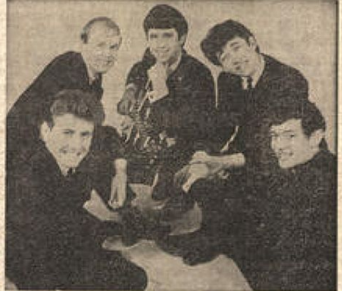
THE HOLLIES —their likes and dislikes are wide and varied.

Allan Clarke (lead singer and harmonica) Born Salford, April 5, 1942... first sang in church choir... boyhood friend of Graham Nash... played guitar in club skiffle groups at 13 and harmonica with harmonica gang at Salford Boys' Club. Musical tastes: beaty pop groups, especially The Rolling Stones. Solo artists: D u a l y Springfield, Tony Bennett and Ray Charles. Likes classical music. Films and film stars: any film epics, Burt Lancaster and Sophia Loren. Books: Dennis Wheatley and James Bond. Food: Madras curry and Indian dishes. Colours: black and blue. Hobbies: shooting, practising a fast draw, writing songs. Jewellery: plain rings. Clothes: smart suits, but not mod gear. Dislikes: road hogs, trad and modern jazz.