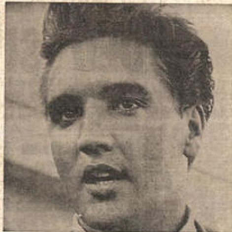
ELVIS PRESLEY—We're hearing a Presley release first this time, thanks to an early look at "Love In Las Vegas."