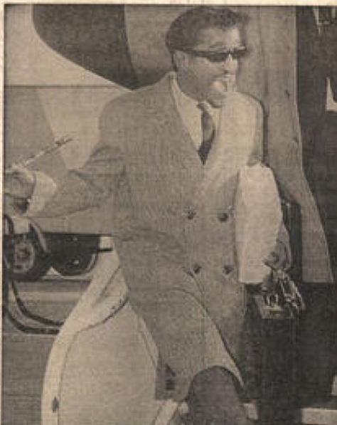
SAMMY DAVIS Jr., bounced into London Airport on Monday for his one-man BBC TV show.