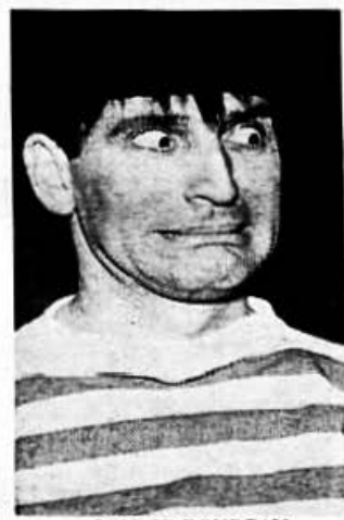
Lonnie Donegan.. comedy proves he can do more than sing. See "And Lonnie" col. 5.

W E are not only having old songs revived in the world of pop music, but also old titles with completely new tunes and words. I am referring to Cliff Richard's record, "A Girl Like You." Mike Preston also had a record with this title. Another recording is by Slim Harpo of "Rainin' In My Heart." Fans of the late Buddy Holly will remember his record with this title.