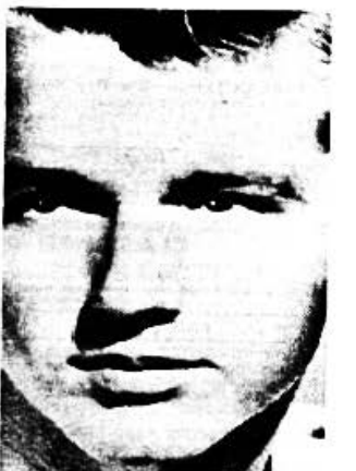
FLOYD CRAMER . . . He helped to sell other pop records. Now it's his turn.