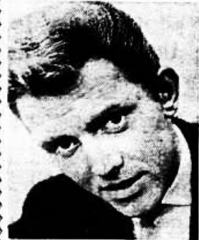
SHANE FENTON gets a Jerry Lordan number for his debut disc.