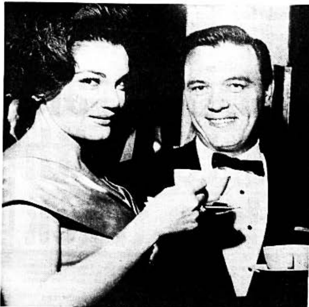
CONNIE STEVENS and MATT MONRO chat over a cup of tea backstage at the London Palladium after Connie had topped the bill there last Sunday.

First and second prize in the contest are two tape recorders—the 105 guinea Veritone (left) and the Stuzzi.