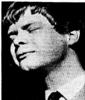
Blues from Long John Baldry.