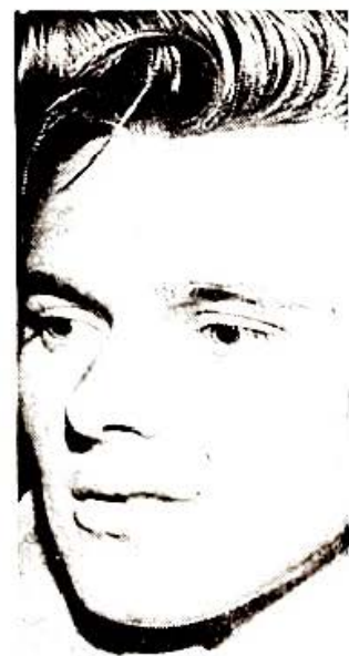
NBC has picked BILLY FURY to represent BRITAIN on U.S. TV.

His contribution to "The Dave Brinkley Journal" will be filmed in London, and discussions are in progress between NBC and the Parnes office with a view to shooting his spot on October 15.