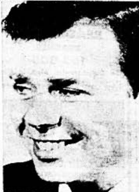
Another version of "Milord" from JORGEN INGMANN

MICHAEL ANGELO Rocco's Theme; Spinnerette (Columbia DB 4705)*** ORCHESTRAL performance of the theme tune from the Italian film, "Rocco and his Brothers."