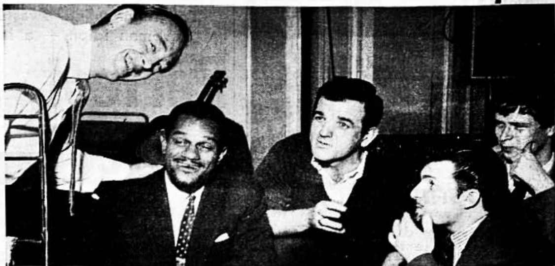
Break during rehearsals finds Chris Barber, Joe Harriott, Alan Freeman, Diz Disley and Long John Baldry discussed last minute arrangements.

The BBC are making a big thing of "Trad Tavern." From a jazz viewpoint, its first airing was first-class.