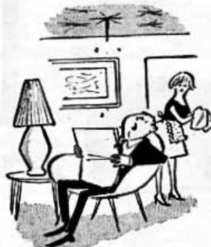
"We shall really have to complain about that fellow's confounded double-bass!"