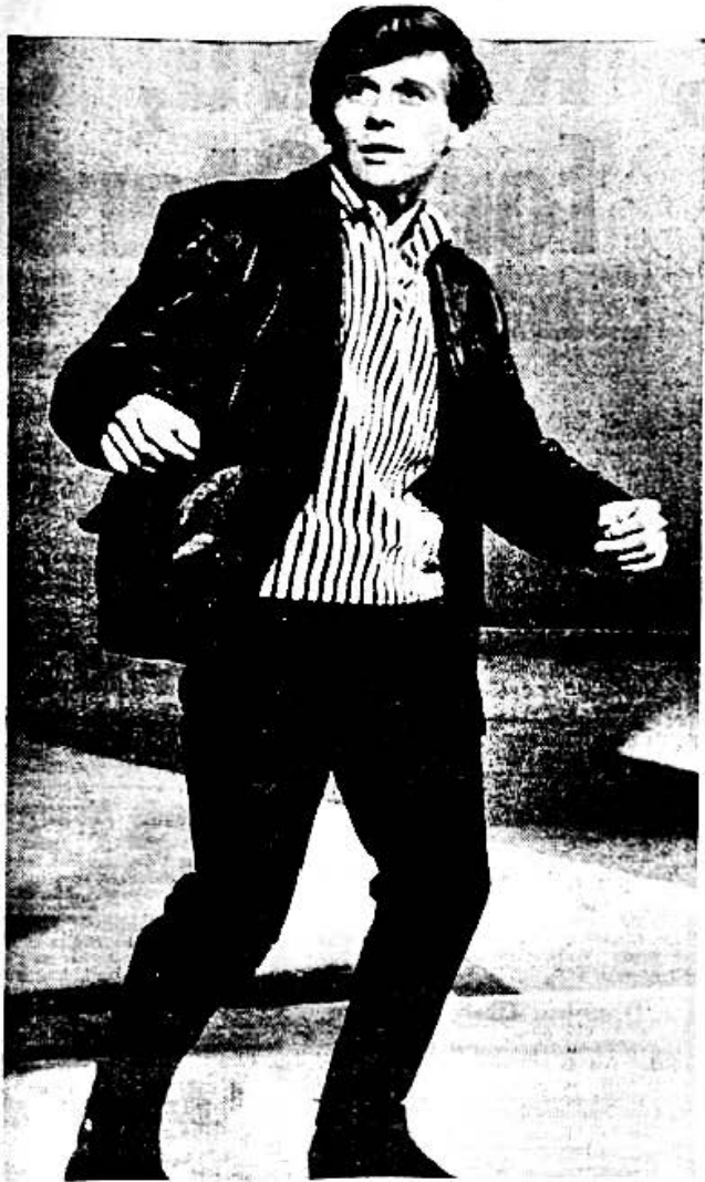
JOHN LEYTON as he appeared on last Saturday's "Thank Your Lucky Stars" TV show singing "Wild Wind."