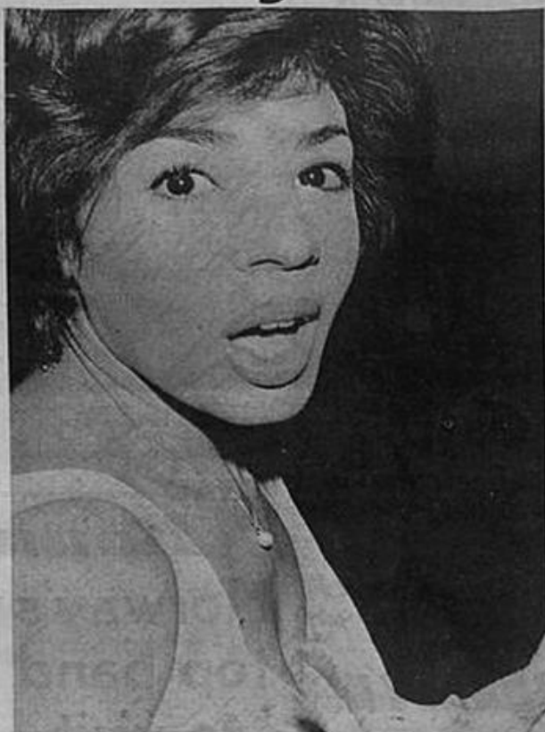
SHIRLEY BASSEY... she cut her smash hit "As Long As He Needs Me," which was recorded over seven months ago. Now she's going to rest for two months.