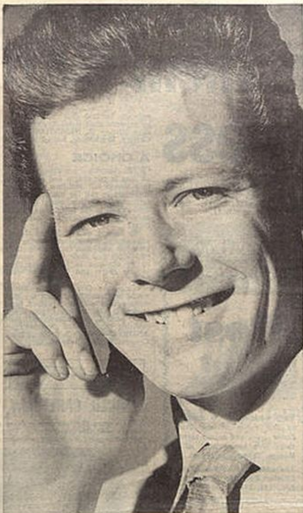
CRAIG DOUGLAS—The "clean" version of "A Hundred Pounds Of Clay" is on special order!

Johnny Mathis has a new LP released in the States this week. With backing by Nelson Riddle and his Orchestra, the title is "I'll Buy You A Star," and the album is mainly ballads.