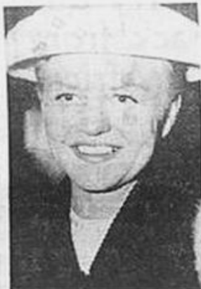
PEGGY LEE . . . her first book about to be published *

musical director and drummer. He declared that the proposed addition to his entourage would cost his estate $550 a week, but would be in his best interests. The Court said "yes."