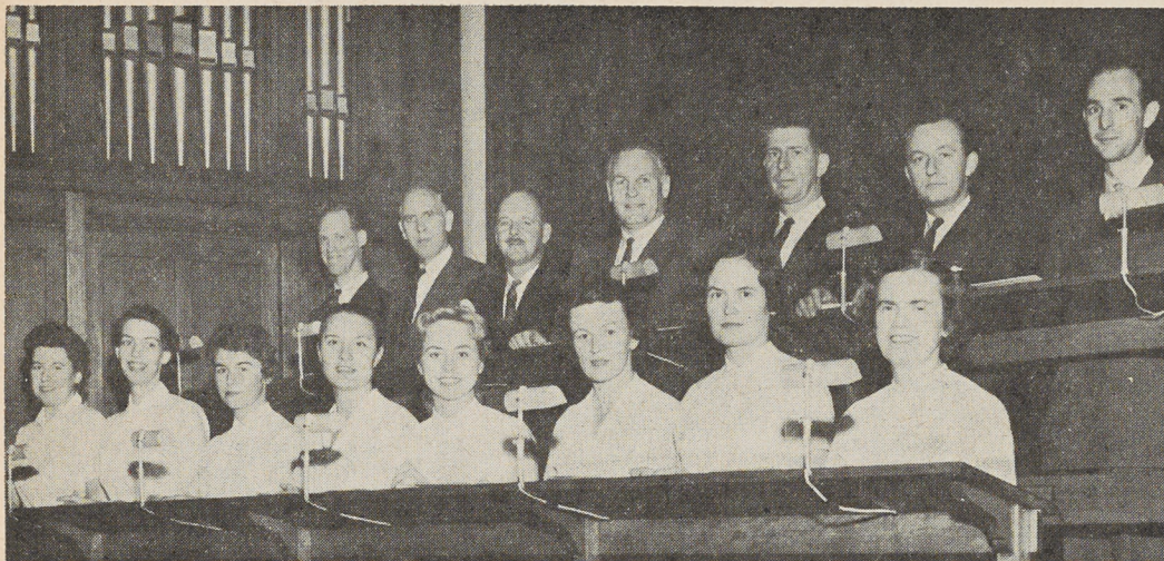
The Renaissance Singers of Montreal perform: