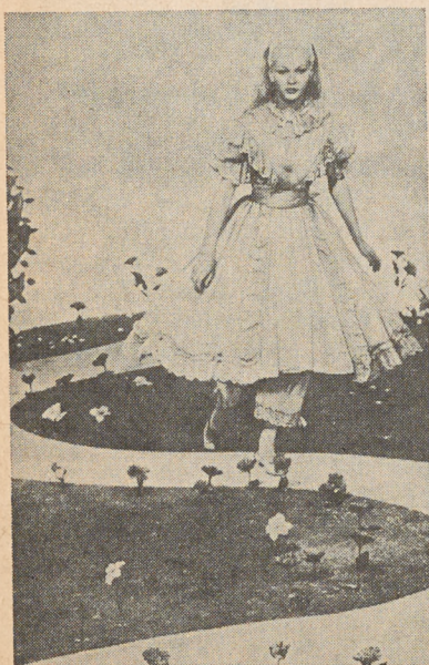
Carol Marsh as Alice