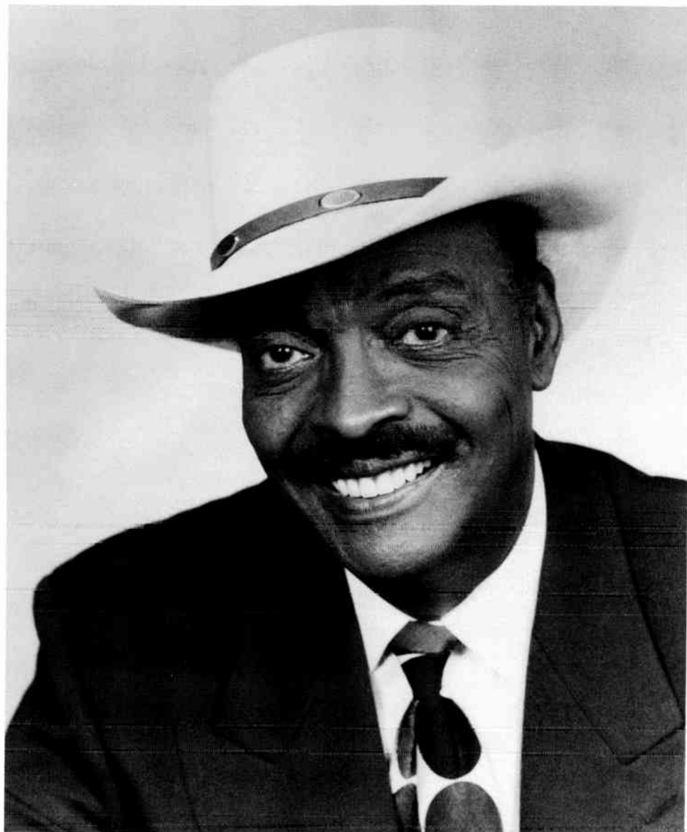
Herb Kent.