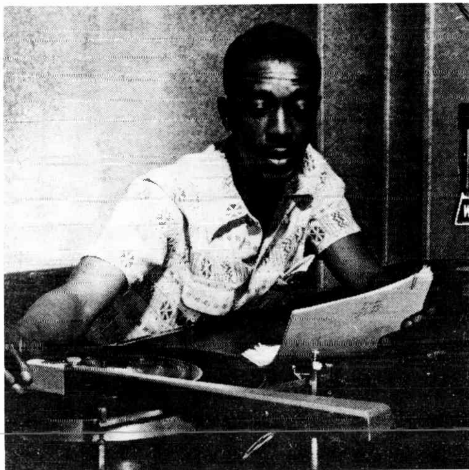
Al Benson.