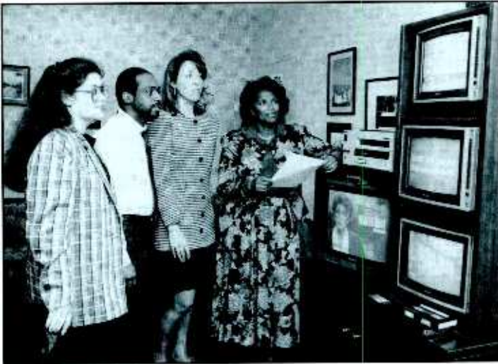
Program directors screen many shows before making up the weekly, monthly or quarterly schedule.

The PRODUCTION ASSISTANT role may have been the gateway to a television career for more top local and national broadcasters and production executives than any other position in a station. This is the ideal entry-level position for anyone interested in a career in almost any aspect of television. This job essentially amounts to an apprenticeship in television.