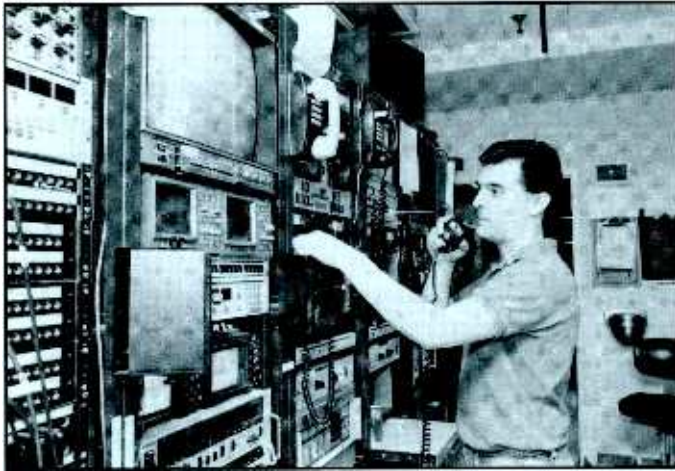
Taking in feeds from various sources is part of the duties of an Electronic News Gathering (ENG) crew.

opportunity to create a visually appealing and journalistically sound product limited only by his or her imagination and creativity.