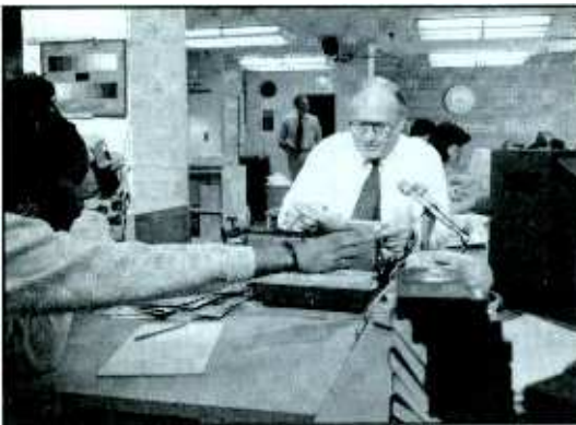
An assistant director cues a news anchor during a live update.

The position of news director is generally the high point of a long career in broadcast journalism. News directors almost always