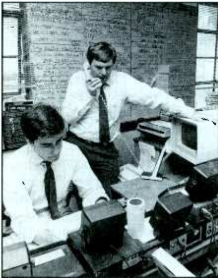
The list of the day's stories is displayed near the assignment desk. Editors are constantly monitoring police and fire department scanners for breaking stories.

Two of the most common specialty reporting positions in local television are SPORTS REPORTER and WEATHER REPORTER . Many sports reporters are former athletes, however much more than athletic ability and background is now expected of a successful sports journalist. The sports reporter may be called upon to cover the business, political and social aspects of athletics in the