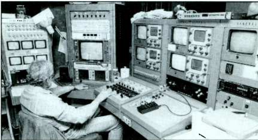
Master Control is where all broadcast signals are routed before they are sent to the transmitter and equipment is monitored for any potential problems that would cause the station to go off the air.

As technology increases, there is a growing trend for technical personnel to be trained and skilled in a variety of engineering functions because they are so closely interrelated in broadcasting.