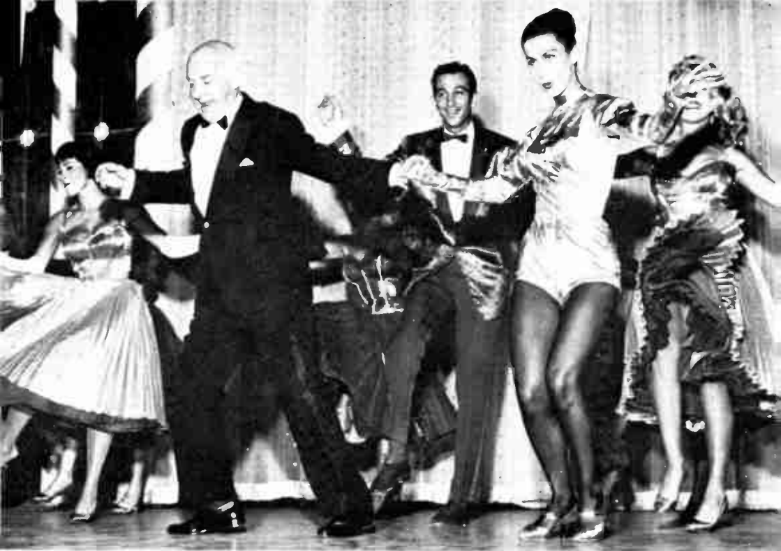
The old hooper's last fling in Las Vegas.