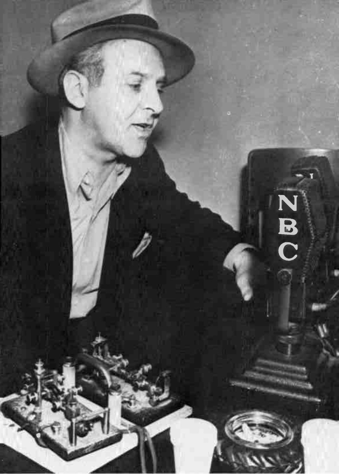
Good evening, Mr. and Mrs. America and all the ships at sea. Let's go to press!