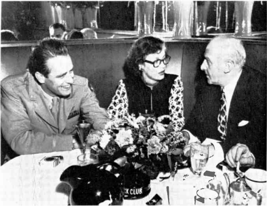
King Walter on his Stork Club throne at Table 50, welcoming the Elliott Roosevelts.