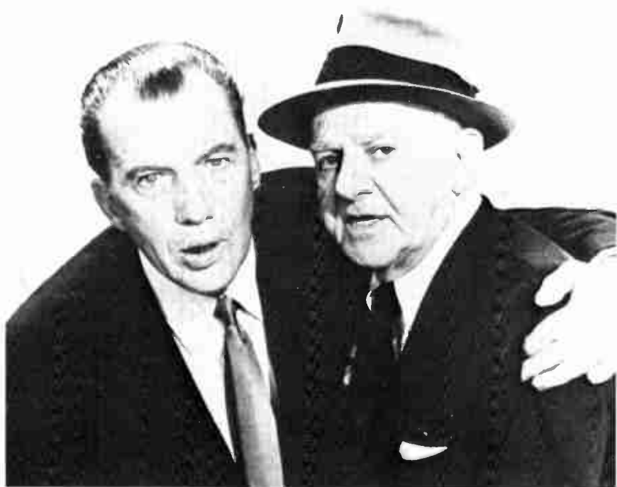
Walter and Ed Sullivan: Old age transforms old enemies into old "friends."