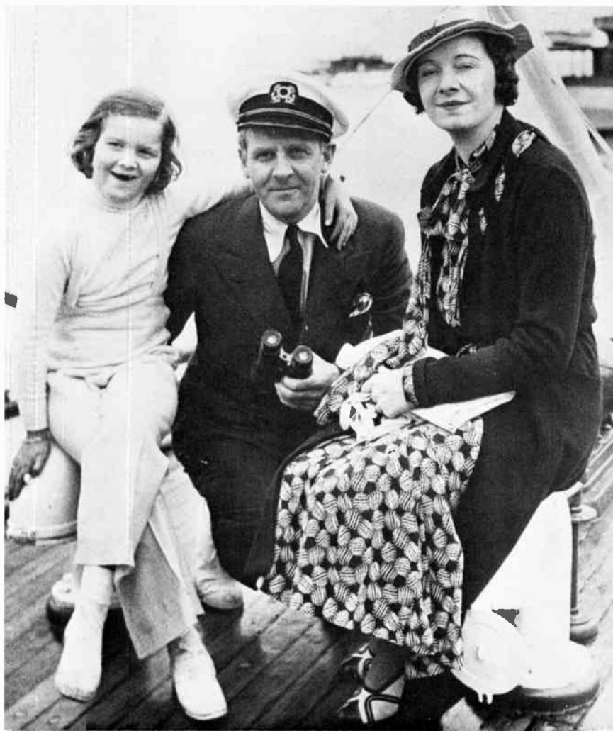
The good old days: The Walter Winchells and daughter Walda. The photo was taken in California when he was recovering from his Vincent Coll scoop.