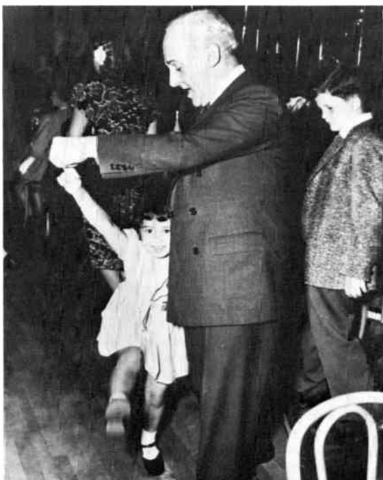
The hooper and his adopted China Doll, at the Stork Club, of course.