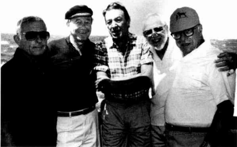
At sea with Thornton Bradshaw, Mike Wallace, David Wolper, and Art Buchwald.