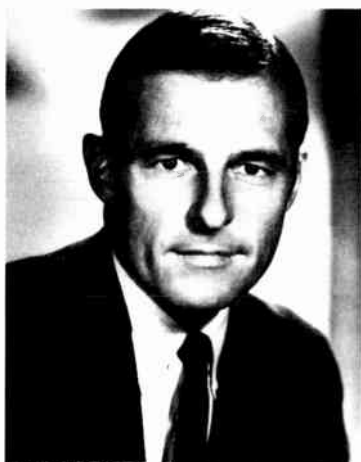
Portrait of the author as a new NBC vice president, 1961.