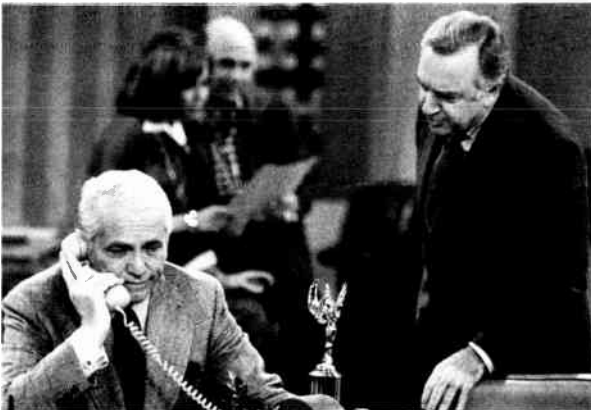
Ted Baxter with his idol, Walter Cronkite.