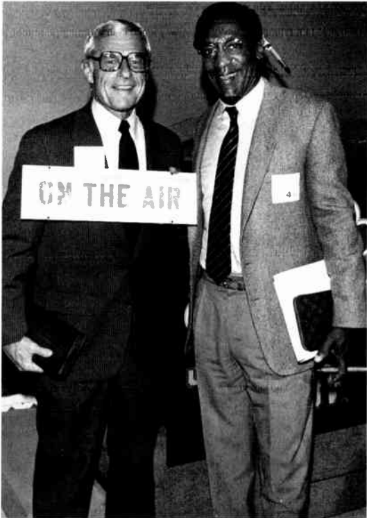
The Chairman and the King.