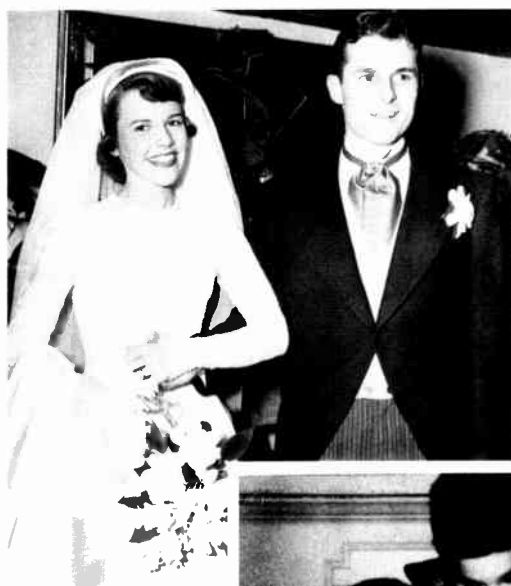
Ruth and I—the big day.