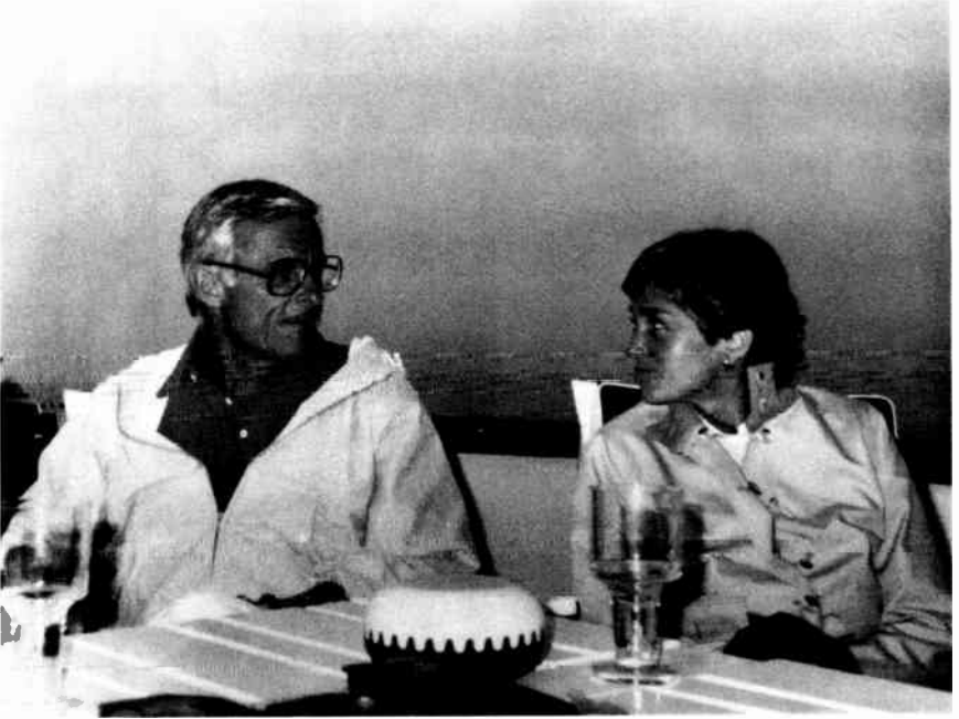
A more private moment.