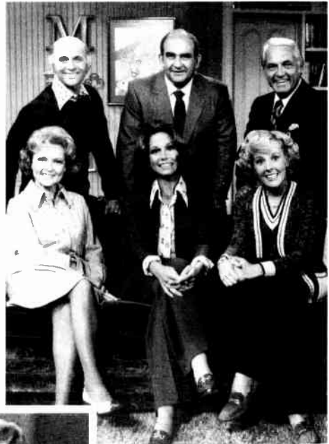
Betty White, Mary, Georgia Engel, Gavin MacLeod, Ed Asner, and Ted Knight; Cloris Leachman and Valerie Harper had already spun off into their own series.