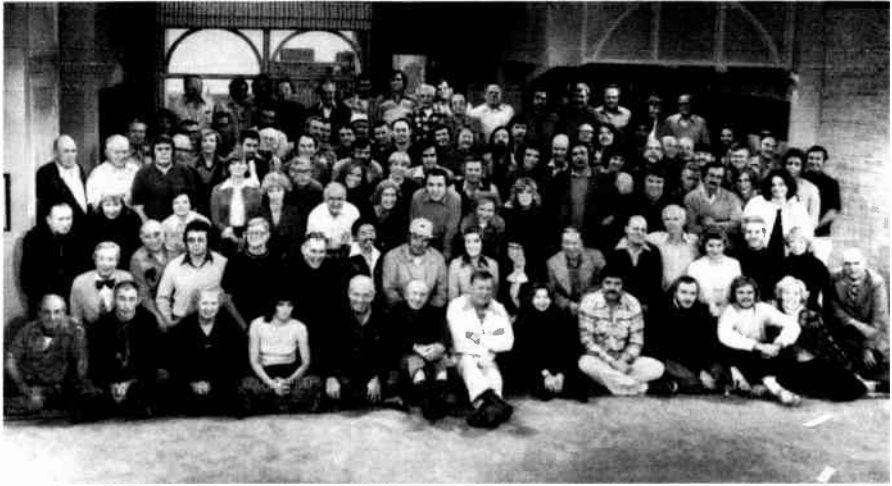
All these people to make one show—the cast and crew of Mary Tyler Moore .