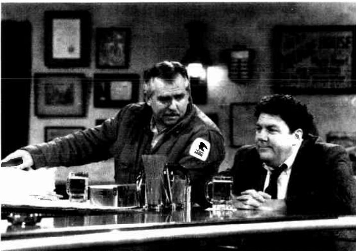
Cheers stalwarts John Ratzenberger and George Wendt.