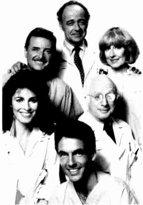
St. Elsewhere originals. (NBC)