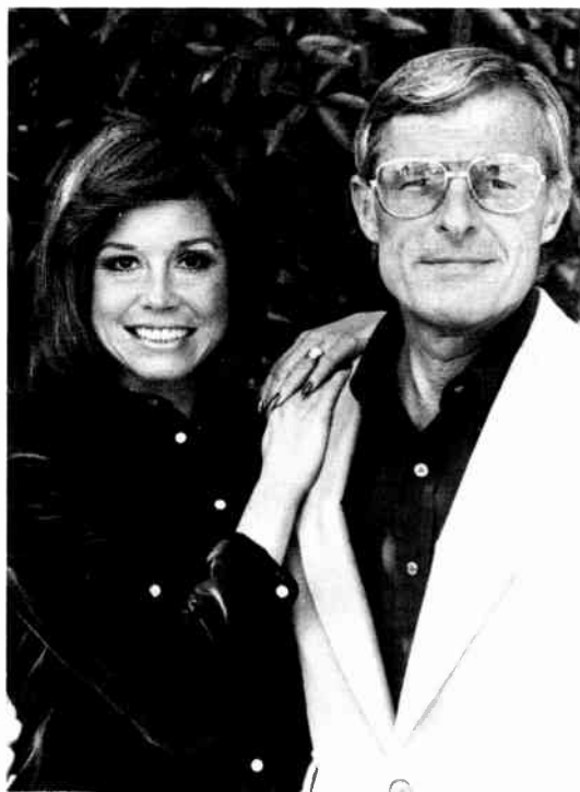
MTM's founding couple.