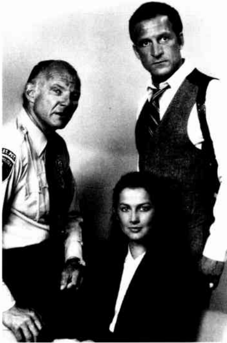
Hill Streeters Michael Conrad, Veronica Hamel, and Daniel J. Travanti.