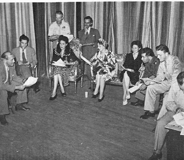
Jack Benny and cast with Fred in rehearsal for radio broadcast from Cairo, Egypt during World War II.