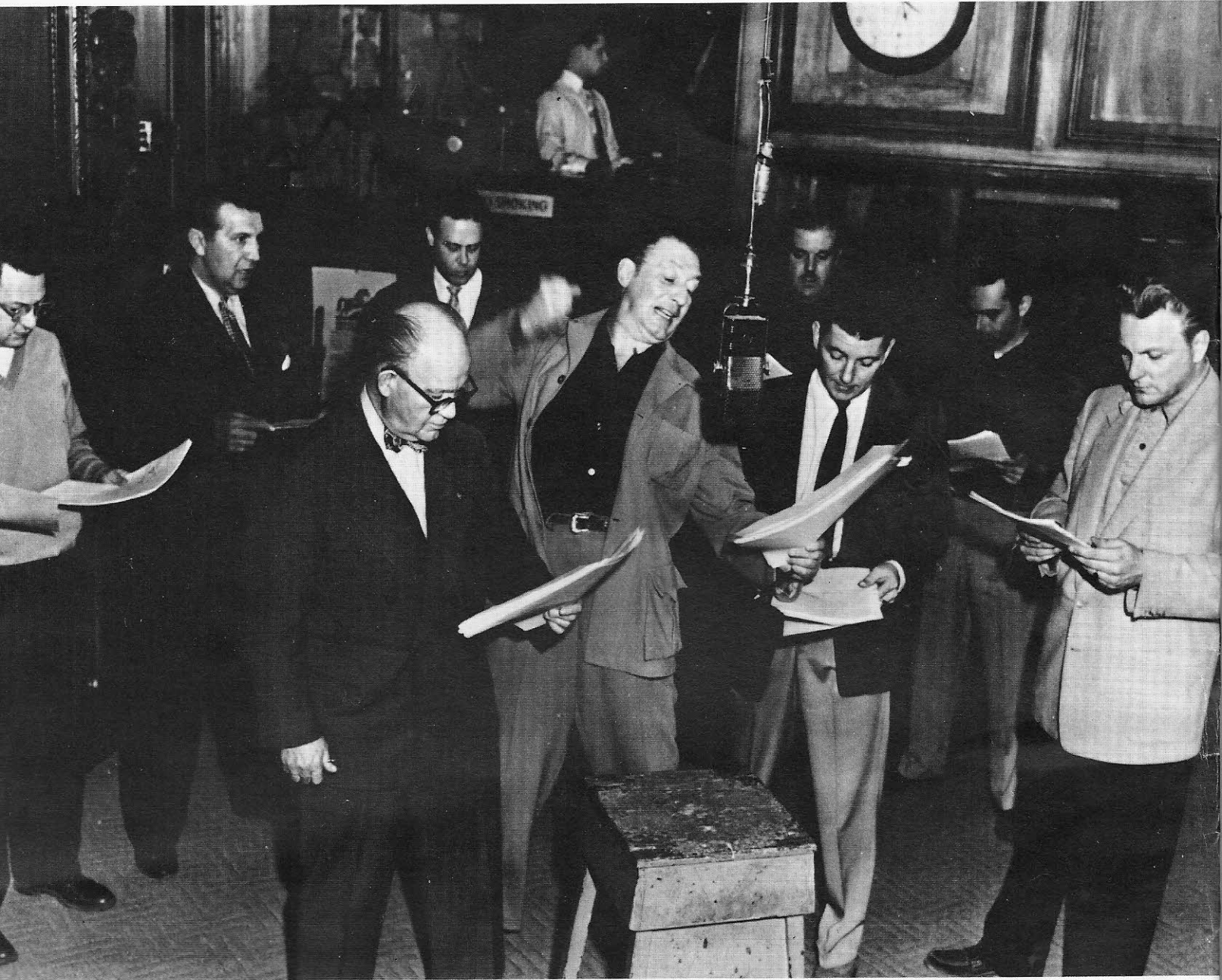
In rehearsal at WXYZ, Detroit.