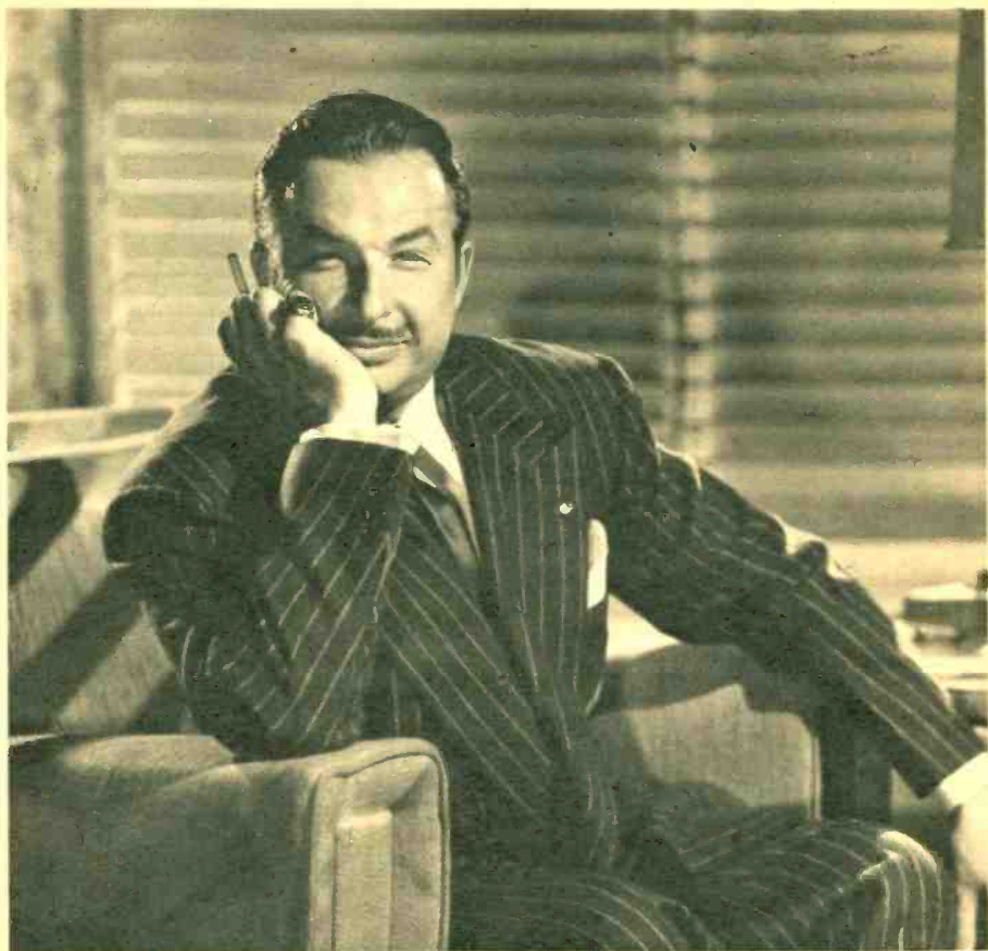
ACTUALLY AN ASTUTE BUSINESS MAN, XAVIER CUGAT ENJOYS PLAYING THE PUBLIC ROLE OF AN ECCENTRIC, TEMPERAMENTAL MUSICIAN