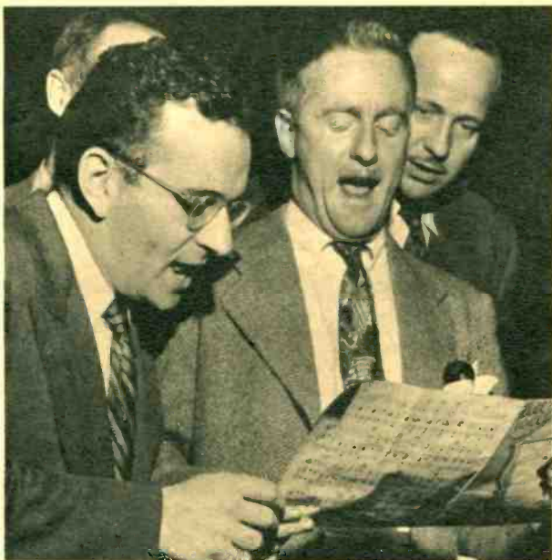
THE SHOW USES MANY TOP ACTORS—LIKE MARTIN GABEL, PETER DONALD, DWIGHT WEIST

Production and sound men have no dull moments when they are assigned to "The March of Time." When a Spitfire fights a Messerschmidt, three sound men must see that the sounds which