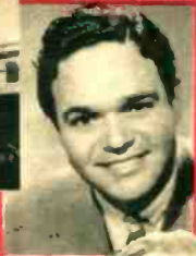
TEXACO-STAR THEATRE Sunday 9:30 pm