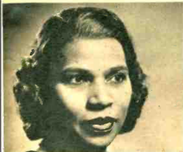
A REALLY GREAT VOICE: MARIAN ANDERSON