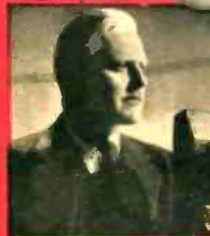
NEW YORK PHILHARMONIC SYMPHONY Sunday 3:00 pm