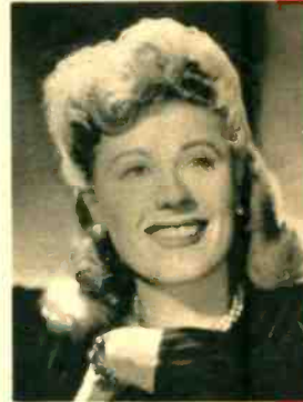
THE JOAN DAVIS SHOW Monday 8:30 pm