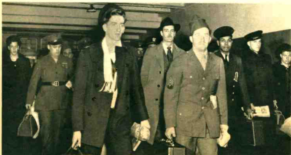
DIRECTOR KREMER MINGLES WITH THE CROWDS IN GRAND CENTRAL TO GET THE AUTHENTIC, EAR-SPLITTING EFFECT OF A RAILWAY STATION