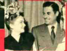
SCREEN GUILD PLAYERS Monday 10:00 pm