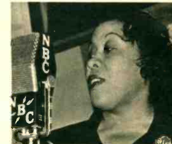
LILLIAN RANDOLPH STARS FROM WEST COAST