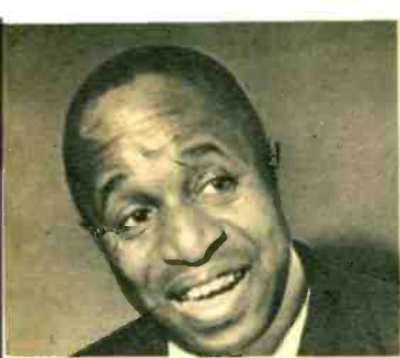
EDDIE GREEN STARS ON "DUFFY'S TAVERN"