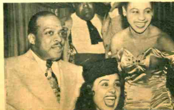
TRIO: BAND-LEADER COUNT BASIE AND SONGSTRESS' LENA HORNE AND THELMA CARPENTER