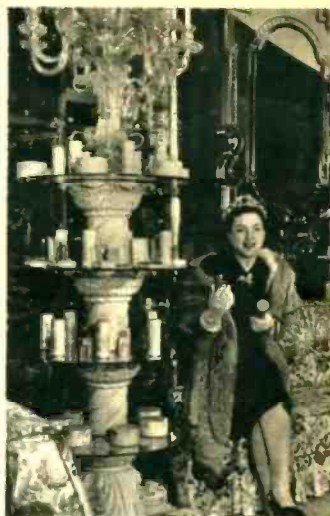
5. Next she selects several different kinds of perfume to go with her new personality, and tusses in her favorite talcum.