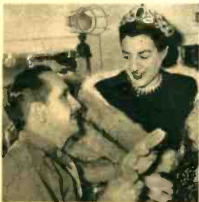
8. The Queen gets a lesson in stage make-up from ex-movie actor Fredric March.