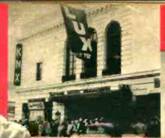
LUX RADIO THEATRE Monday 9:00 pm