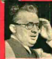
DR. CHRISTIAN Wednesday 8:30 pm