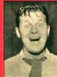
THE JACK CARSON SHOW Wednesday 8:00 pm