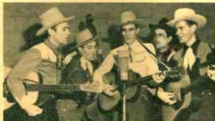
THE FIVE TEXAS TROUBADOURS IN ACTION (ERNEST TUBB, CENTER)