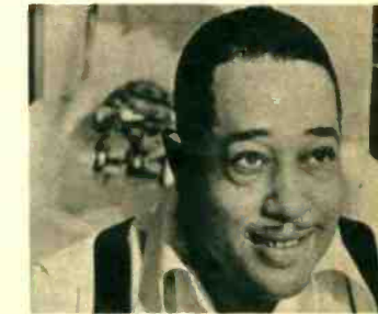
THE GREAT, INCOMPARABLE DUKE ELLINGTON