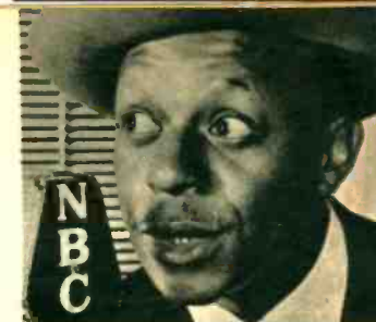
EDDIE ANDERSON IS KNOWN AS "ROCHESTER"