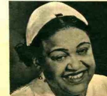
BELIEVED SOAP OPERA STAR GEORGIA BURKE