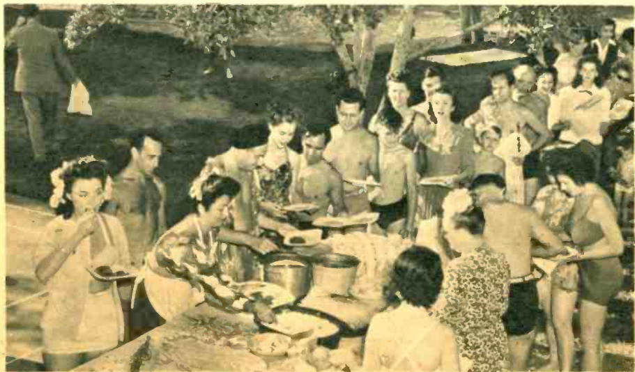
THE 45-YEAR-OLD MAESTRO (IN BERT) LOVES TO COOK AND ENTERTAIN. SAYS HIS FAVORITE RECIPE IS LOBSTER IN CHOCOLATE SAUCE

several occasions. Once a sensitive lady sued him for insulting her, and later his wife divorced him for "answering back" in domestic quarrels by drawing horrible pictures of her. Now Cugat refuses to sketch women, is saving devastating ideas for a cartoon book "to be published when I am 500 miles across zee border."