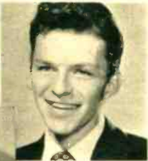
THE FRANK SINATRA SHOW Wednesday 9:00 pm

For inspiring music, great theatre, laughter and information at its best, here are 26 performers of superb radio—the leaders in America's all-out favorite form of entertainment. Tune in every night in the week on your local CBS station.