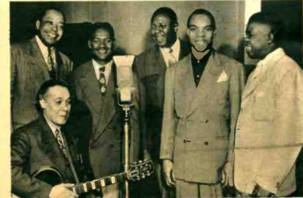
THE JUBILAIRE, A FIVE-MAN QUARTET, ARE ONE OF THE BIG RADIO DISCOVERIES OF 1945