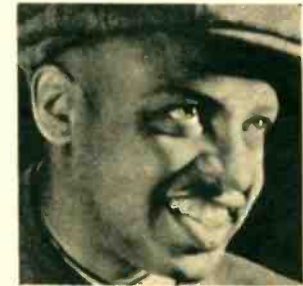
HOT JIVE BAND-LEADER LIONEL HAMPTON

quartets (The Jubilaires, The Delta Rhythm Boys), folk songs (Josh White, Huddy Leadbetter), or jazz orchestras (Duke Ellington, Count Basie, Cab Calloway, Lionel Hampton) Negroes are always to be found at the top of any list of radio's great musical entertainers. Possibly in music what Gertrude Stein called the Negro's "instinctive sense of rhythm" has the best opportunity for expressing itself. Lionel Hampton's hot, uninhibited playing of the popular tunes, Duke Ellington's polished, intellectualized interpretations of the jazz classics, Lena Horne's sweet, sultry warblings of a sentimental ballad, The Jubilaires' soft, restrained harmonizing of a century-old spiritual, and Marian Anderson's great contralto voice singing some of the popular operatic arias, is, each in its own way, an incomparable expression of the moods and sentiments of all Americans everywhere.