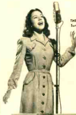
THE FAMILY HOUR Sunday 5:00 pm