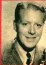
THE ELECTRIC HOUR Sunday 4:30 pm