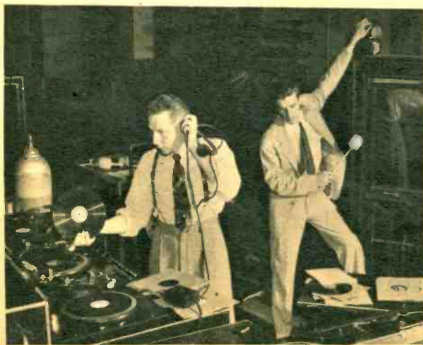
AN EXTENSIVE "LIBRARY" OF SOUND EFFECTS ADDS TO THE PROGRAM'S AUTHENTICITY