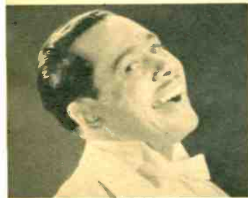
SUAVE, SLEEK BATON-WAVER CAB CALLOWAY