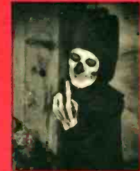
INNER SANCTUM Tuesday 9:00 pm