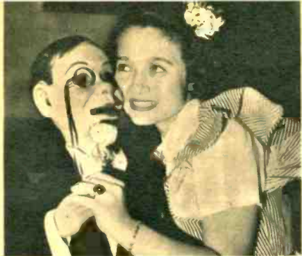
Radio's Casanova makes Sunday-night love to one of his "women."

EASTERN WAR TIME INDICATED. DEDUCT 1 HOUR FOR LISTED TIME—1 HOUR FOR PACIFIC TIME. NBC IS LISTED (N), CBS (C), AMERICAN BROADCASTING CO. (A), MBS (M), ASTERISKED PROGRAMS (*) ARE REBROADCAST AT VARIOUS TIMES; CHECK LOCAL NEWSPAPERS.