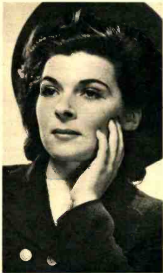
BUT, IN REAL LIFE, MISS WOLFE IS QUITE ANOTHER PERSON!