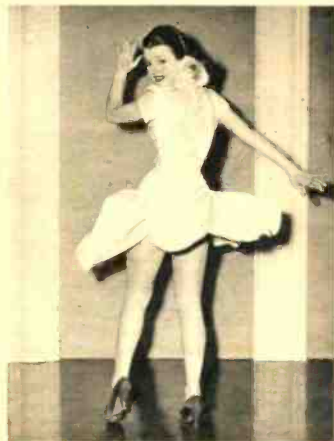
SHE'S WORKED HARD, to develop not only her dancing but other talents, as additional rungs on the ladder of success she's climbing.

Now Dale's doing well on both celluloid and ether. She sings on the Jack Carson broadcasts, sings and dances in her many Republic films. And, as practically permanent leading lady for star cowboy-crooner Roy Rogers, she's adding further tricks to her trade—becoming an accomplished horsewoman!