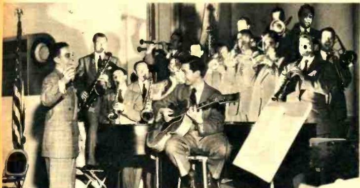
STILL IN ITS FIRST YEAR, the 1941 Frankie Carle Orchestra has proved an immediate success. The band was recruited on the West Coast and includes a number of talented youngsters. With first-rate contracts behind them, the boys feel pretty sure of clear sailing in the future.

Now that long, hard struggle is all past history, and the "golden touch" really means something at last. The new band has brought in not only fancy profits on its own, but also regular radio appearances on such programs as the CBS "Allan Jones Show." All Frankie Carle needs to make his happiness complete is another hit like "Sunrise Serenade."