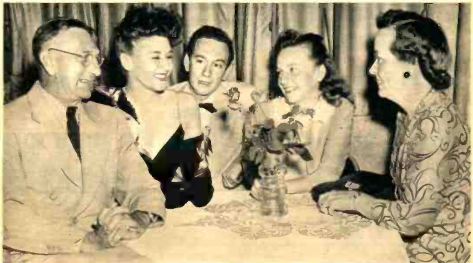
REAL TABLES, REAL ROSES—AND REAL GUESTS—HELP HILDEGARDE CREATE THE CAFE-LIKE SETTING OF HER "RALEIGH ROOM" BROADCASTS

See what I mean about experience? Television means the return of vaudeville with a bang. Cafes and theatres will be combed for material. New faces