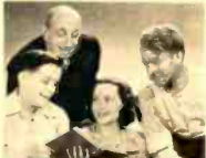
8 This family scene is typical of the well-known serial: (A) One Man's Family (B) Vic & Sade (C) Easy Aces