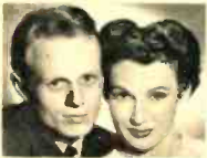
3 Dick Widmark and Florence Williams plays leads in: (A) Flashgun Casey (B) Front Page Fazzell (C) Hot Copy