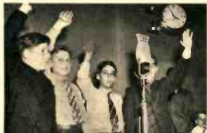
YOUNGSTERS PARTICIPATE IN OVER-THE-MIKE DISCUSSIONS