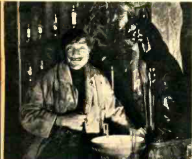
A WEIRD BACKGROUND ADDS HORROR TO THE ROLE OF BELA LUGOSI