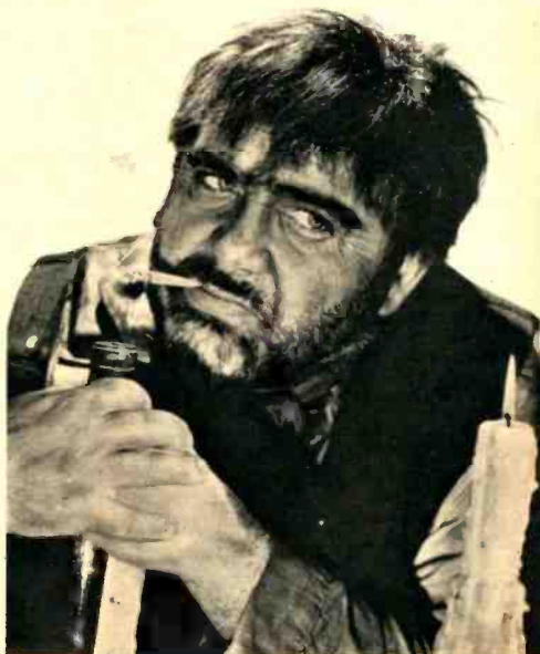
ARIM TAMIROFF, AS A CYNICAL ADVENTURER, REGARDS THE WORLD WITH A BALEFUL EYE