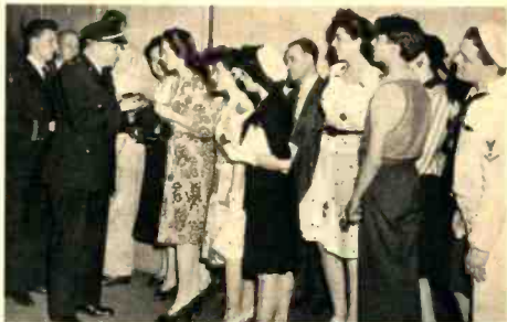
Guests of the Dunninger Show are "searched" by a smiling studio cop before participating in a special stunt which has been dreamed up for the Blue broadcast. They can't check their minds outside the door, however—and that's what the Master Mentalist wants to work on, anyway!