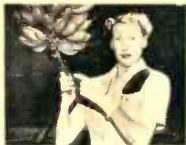
2 This long, lanky, loco Comedienne is, of course: (A) Charlotte Greenwood (B) Patsy Kelly (C) Fanny Brice