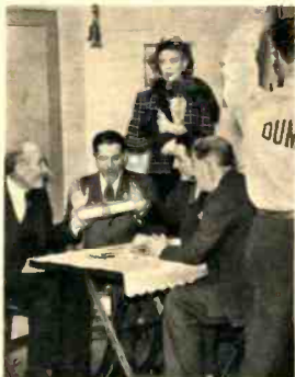
COMEDY TO BE WITNESSED as well as heard is sent out over the air in "If Men Played Cards as Women Do," Practico Playhouse skit presented over DuMont station W2XWV.

As HILDEGARDE points out in her story on page 7, television means greater opportunities for performers who must be seen to be appreciated. Here, in pictures, is proof of how much "video" programs can differ from straight radio—with visual comedy, fantasy, dancers and sketch-artists at work.