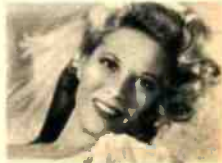
DINAH SHORE SONG-STYLES A NEW DISC

TOGETHER—Dinah Shore (Victor): Dinah's latest disc hit features a mixed-chorus backing, imitating muted brass, organ, etc. "I Learned a Lesson" is on the other side—and both are bound to ring the bell for Dinah's many fans.