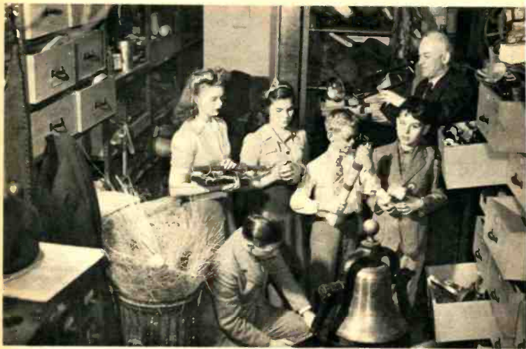
STUDENTS OF THE NEW YORK INSTITUTE FOR EDUCATION OF THE BLIND VISIT CBS AND LEARN HOW SERIES' SOUND EFFECTS ARE CREATED

tizations of this type were panoramic, surveying the scene in chronological, history-book fashion. But today the School is using what Hollywood calls "sympathetic identification," with notable results. In simpler terms, this is just the "This concerns me—why, this could be my problem!" method.