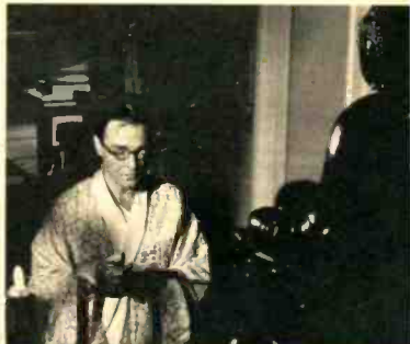
HEAVY-LIDDEN PETER LORRE BOWS DOWN BEFORE A HEATHEN IDOL

who settle back comfortably in their chairs with the solution neatly tied up are given a good jolting.