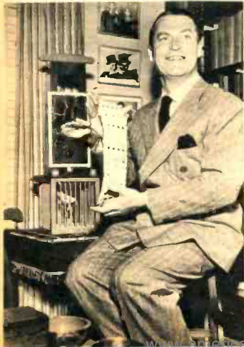
Actor Chester Morris proves he has more tricks up his sleeve than the dramatic ability to portray "Boston Blackie" during "Amos 'n' Andy's" holidays. The screen star's a top-ranking amateur magician.