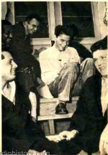
It's Hard to Tell who's enjoying Frank Sinatra's hospital visit the most—the wounded service men or the Swagon Prince himself. After umpteen songs come autographs for wives and sweethearts back home.