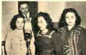
BROADCASTING TEACHES CHILDREN HOW TO EXPRESS IDEAS

This growing interest among out-of-school listeners—also attested by the number of local stations now rebroadcasting various series for swing-shifters and other late audiences—must be particularly gratifying to Lyman Bryson, who is not