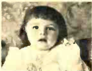
4 Little did his mother know he would rise to stardom as: (A) Allan Jones (B) Paul Whiteman (C) Ed Gardner