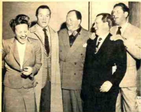
Field Day for Autogrofriends was this stellar War Bond rally round-up at NBC's Hollywood studios. The lugubrious guy in the lead ensemble is Bob Hope, who's sounding off to the joy of Marian (Molly) Jordan, John Charles Thomas, James (Fibber McGee) Jordan, Bob Burns.