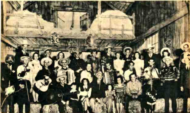
A BARN STAGE SET WITH REAL HAY AND REAL CHICKENS PUTS THE BUSTICALLY-OUTFITTED CAST RIGHT IN THE MOOD FOR THEIR FROLIC