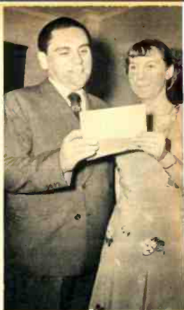
Ate Customer of Bob Hawk—War Bond salesman and "Thanks to the Yanks" emcee—is Mrs. Dwight Eisenhower, wife of the General.