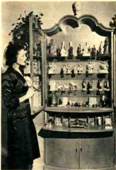
COLLECTING porcelain, especially Dresden and Meissen china, is one of Miss Menken's hobbies, though her wartime activities leave very little time for it now.