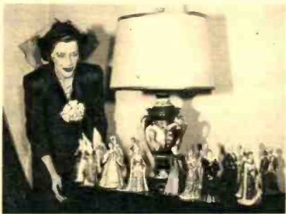
THE PARADE of history is represented by miniature queens, each an exquisite study in costume detail. The tiny figurines must be dusted with a soft, fine brush.