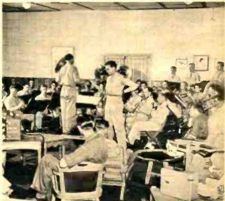
AUSTIN, TEXAS—Station KNOW—The 76th Army Air Forces Band gives a 15-minute broadcast every Tuesday afternoon from the Service Club at Bergstrom Field. Program appeals to GI's and civilians alike, for the band plays both strictly military marches and sweet swing tunes.