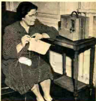
AN EVALUATION COMMITTEE MEMBER CHECKS PROGRAMS AT HOME

The speakers who have addressed the council now include one member of the Federal Communications Commission; representatives of all major networks out of New York and Chicago; representatives of the Canadian Broadcasting Corporation; the National Association of Manufacturers; the British Broadcasting Corporation; the National Association of Broadcasters; radio advertising agencies; market research groups; experts on children's programs; educators in radio; government agencies; the Bureau of Jewish Education; the