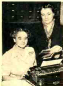
CLUBWOMEN TYPE FOR THE NEXT MEETING

F OUR YEARS, radio has depended upon professional surveys and various popular polls to discover the rating of its programs. It has scanned listener mail to catch the pulse of audience criticism. But it has only been within the last few years that voluntary organizations, known as radio councils, have begun springing up about the country. These councils represent a cross section of those who listen in their communities. Their members are just plain, everyday Mr. and Mrs. People who have suddenly discovered that broadcasting and its home influence are important enough for serious study.