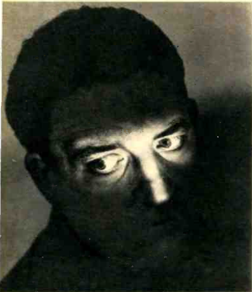
"ARE THESE THE EYES OF A MURDERER?" WITH THE ACTOR, LAIRD CREGAR, AS THE SUBJECT