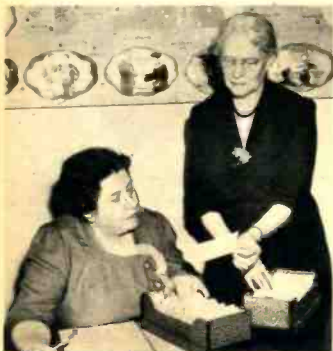
BUSY VOLUNTEERS KEEP THE RADIO PROGRAM FILES UP TO DATE