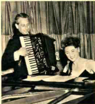
MAJOR ALEXANDER DE SEVERSKY ADDS UNEXPECTED MUSICAL NOTE

will turn up. You'll see everything in television—even acrobats and magicians who pull rabbits out of hats. You'll see pantomime artists who don't say a word, yet their acts will be most effective. What chance would people like these have in radio?