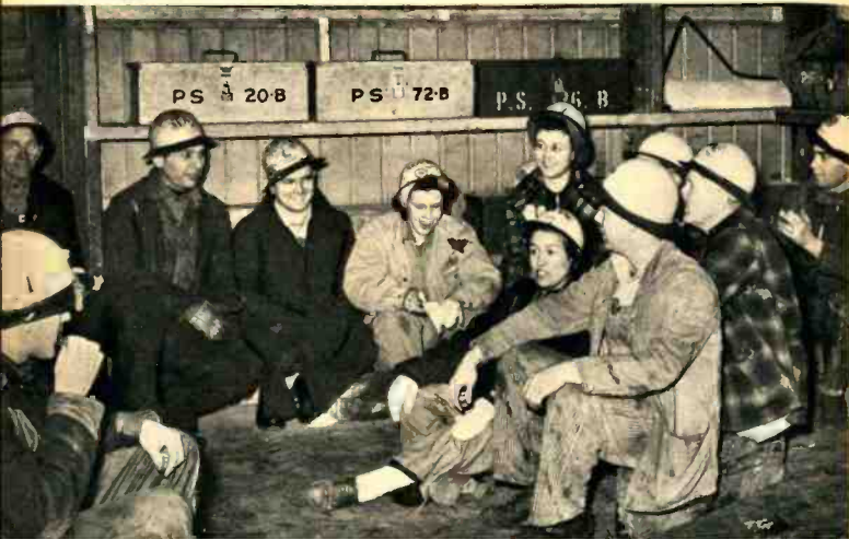
ADULTS ALSO BENEFIT FROM "SCHOOL OF THE AIR"—AS STATION KIRO REBROADCASTS THE COURSES FOR SEATTLE SHIPYARD WORKERS

the broadcasts to their own communities—has been such a development of both education and radio that it's hard to tell which has benefited more. On the educational side, teachers in out-of-the-way places have found that the programs (specifically designed to supplement, not supplant, the personal guidance which can only be given in living classrooms) offer talent and even information which would otherwise be beyond their reach. The radio music series brings them soloists which few schools could afford, little-known folk songs which can't be obtained on records, composers' lives and contributions dramatized as no auditorium could do them. "Science at Work" can explain new discoveries and inventions which aren't in any textbook as yet. "New Horizons" can cover geographical changes before they appear on world maps and modern history while still in the making.