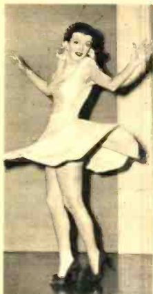
DALE EVANS found that adding dancing to her vocal abilities has greatly helped her career.