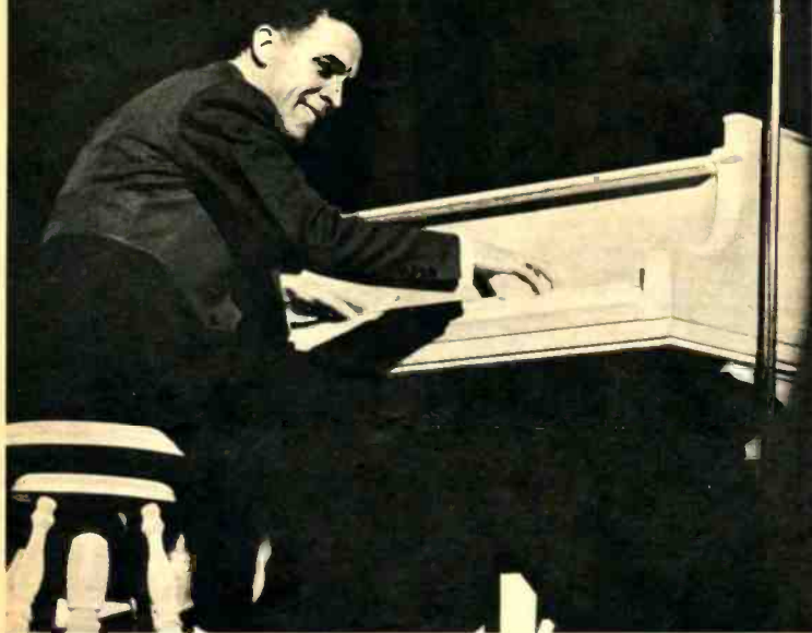
THE DEFT FINGERS OF WIRY LITTLE PIANIST FRANKIE CARLE HAVE BEEN ENTERTAINING THE PUBLIC FOR MORE THAN THIRTY-FIVE YEARS