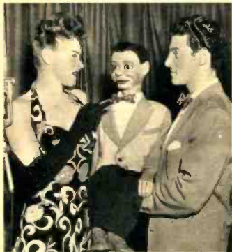
MILDEGADE "WELCOMES" PAUL WINCHELL AND JERRY MAHONEY