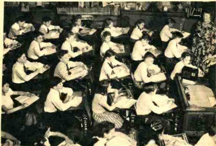
RADIO INVADERS THE MODERN "LITTLE RED SCHOOLHOUSE," AS PUPILS LISTEN TO THE CBS SERIES OF DRAMATIZED CLASSROOM SUBJECTS