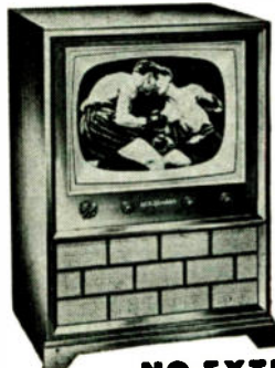
The New RCA Victor

AND NO EXTRAS TO PAY... PRICE INCLUDES 1-YEAR PICTURE TUBE GUARANTEE, FEDERAL TAX, 90-DAY ALL-PARTS WARRANTY.