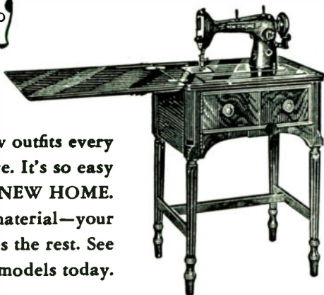
Hepplewhite Table Style 626.

Enjoy new outfits every season . . . and save. It's so easy with the All-New NEW HOME. You just guide the material—your NEW HOME does the rest. See the distinctive new models today.