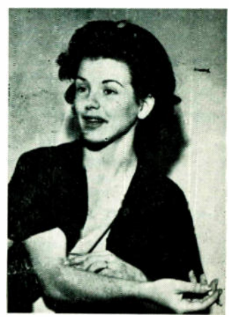
A heroin addict at 18 years, this young girl points to the ugly purple marks of the needle. She was "glad to be arrested."