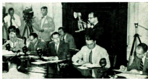
Senate Crime Committee receives evidence that a teen-age epidemic of dope is spreading thru large cities. Sen. Estes Kefauver (in white suit) is major factor against the menace.