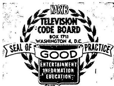
NARTB-TV CODE SEAL

Teletasting Notes: By far the majority of TV stations on the air (95 out of 133), plus all 4 networks, now subscribe to the NARTB Code, entitling them to flash on their screens the NARTB Seal of Good Program Practice. As of