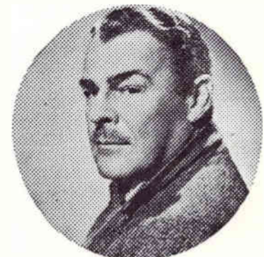
Dangerous Assignment TUESDAY, 7:30 P.M.