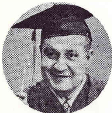
Quiz Kids SUNDAY, 6:00 P.M.