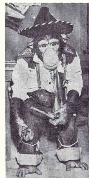
You'll say "The Chimps" is the most unusual show you ever saw on television when it debuts on WOW-TV Sunday, August 12 at 3:30 p.m. for Harvey Bros. (men's clothing, Omaha and Lincoln). Real live chimpanzies, talk, act and perform!