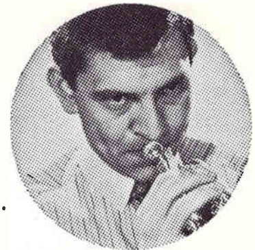
Pete Kelly's Blues WEDNESDAY, 7:00 P.M.