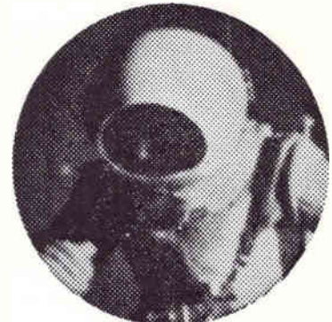
Dimension X THURSDAY, 7:30 P.M.