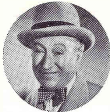
It's Higgins, Sir TUESDAY, 8:00 P.M.