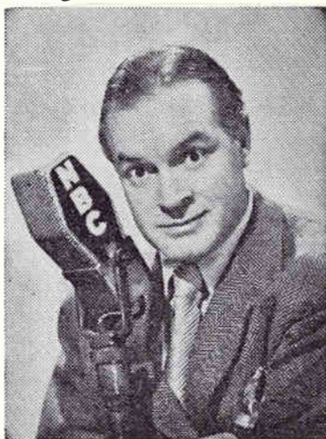
Big-Nosed Bob Hope who made a great name for himself on guest shots last fall and winter will be back with his own weekly Sunday-nighter for Chesterfield.

pects it to keep its net stations, including WOW-TV, in the top Wednesday position.