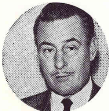
The Saint SUNDAY, 3:00 P.M.