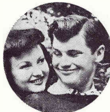
Archie Andrews SUNDAY, 5:30 P.M.