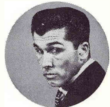
Mr. Moto SUNDAY, 8:30 P.M.