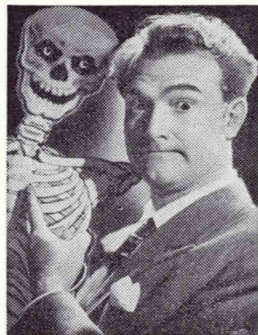
Carrot-topped "Li'l-Bad-Boy" Skelton will have his own Sunday-nighter for Procter & Gamble products, and it's to be one of the most costly shows on the air.

show—added to what made it so popular last year!