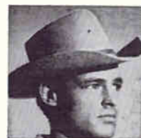
Wild Bill Hickox

1:30 P. M.—America Speaks—M., W., F. (NBC) Snow Crop Matinee—Tu., Th.