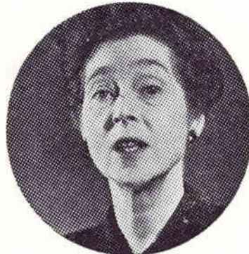
New Theatre SUNDAY, 6:30 P.M.