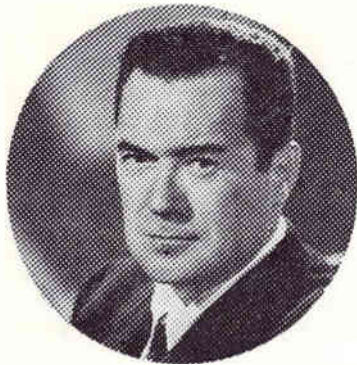
Nightbeat FRIDAY, 7:30 P.M.