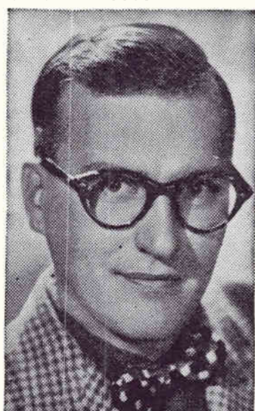
When you "Dial Dave Garroway" you're certain of easy going entertainment from this Dial sponsored favorite.