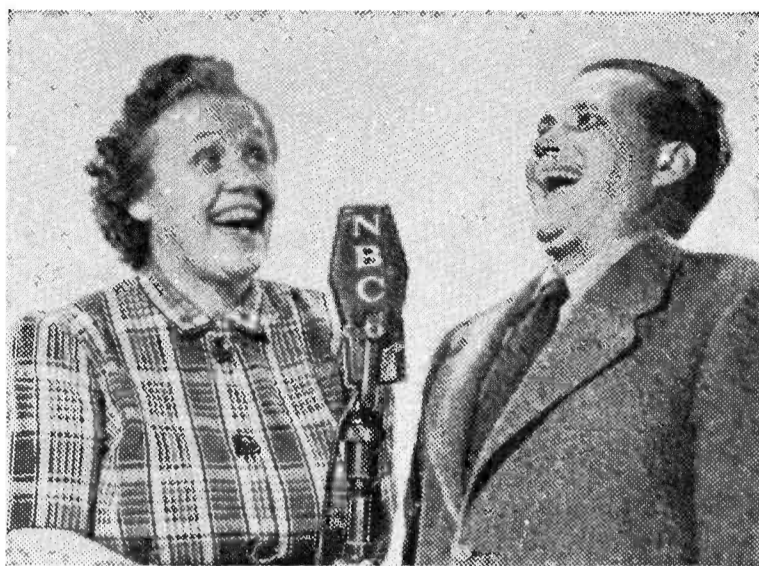
FIBBER AND MOLLY . . . runners-up to Bob Hope as "Champion of Champions," in the opinion of 600 radio editors and columnists. They also scored as radio's best comedy team, and their Johnson Wax show was adjudged as one of radio's best variety programs.