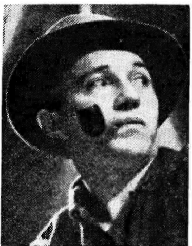
BING CROSBY . . . as master of the "Kraft Music Hall," was considered radio's best emcee, best male vocalist (popular) and boss of radio's best variety show.