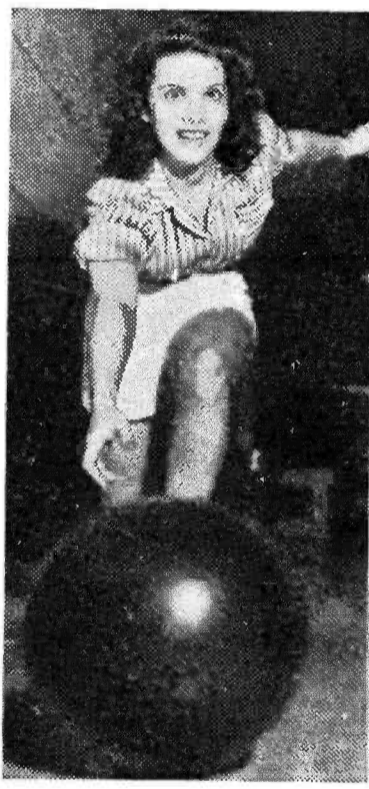
DINAH SHORE . . . songbird on Eddie Cantor's Ipana show, was voted "the year's outstanding new star" and radio's champion feminine vocalist (popular).