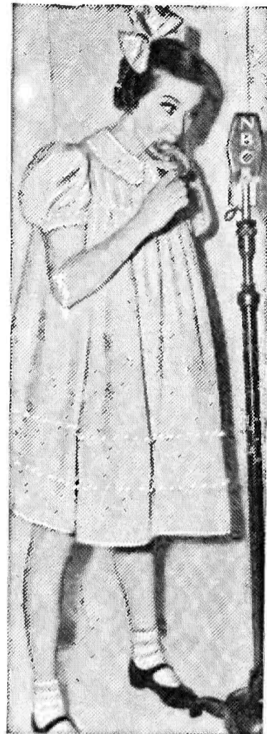
FANNIE BRICE . . . as Baby Snooks on the Maxwell House Coffee show, was adjudged radio's best comedienne.