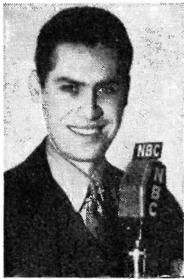
Here's the new "Steve Benton" in the "Wings of Destiny" program. His name is John Hodiak. New time: 8 p. m., Fridays.