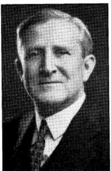
The late Senator Morris E. Sheppard of Texas, Treasurer of the Woodmen of the World, who died suddenly April 9.