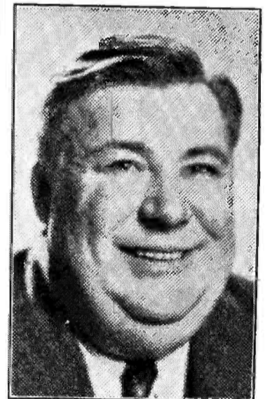
Smilin' Ed McConnell

Smilin' Ed McConnell, the singing philosopher of radio, returned to WOW after a summer layoff, on Saturday in a weekly 15-minute program series under the sponsorship of the Acme White Lead and Color Works. The broadcast may be heard each Saturday from 9:15 to 9:30 a. m.