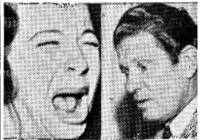
Fannie Brice Bob Burns

Unbeatable as a listenin' night! "Baby Snooks" is good news, and the Krafty Bob Burns, plus Crosby, plus Carpenter, is a sure insurance against thoughts that shouldn't be.