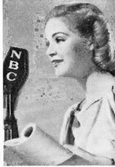
This is Nan Grey, star of Standard Brands' new WOW program, "Those We Love."