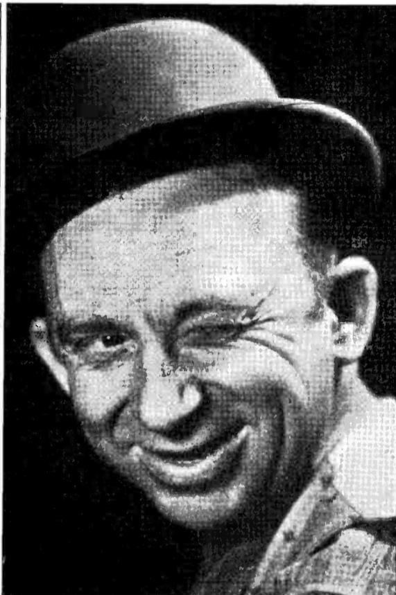
Rudy Vallee calls Rosco Ates, stuttering film comic, one of the funniest men in the world! You'll agree when you see him in person at the Omaha Food Show, October 9, 10 and 11.