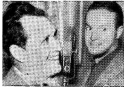
Fibber McGee Bob Hope

It's double-feature, double-laugh night at your speaker! Pepsodent's Bob Hope follows Johnson's Wacky (waxy) "Fibber McGee and Molly."