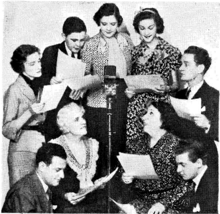
Nearly four years on the air! That's the record of "The O'Neills," the Procter & Gamble show which features the cast shown above. It is packed full of human interest, pathos and excitement.