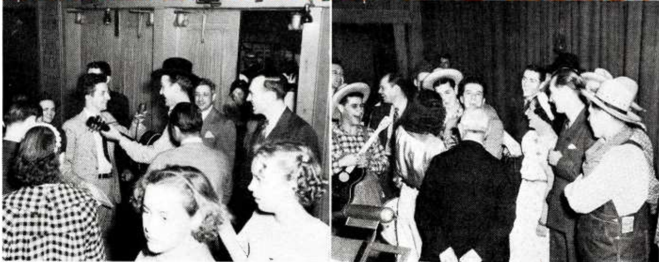
Causing a lot of comment among listeners is the new Meet the Folks show, which is a preview of the Barn Dance each Saturday night.