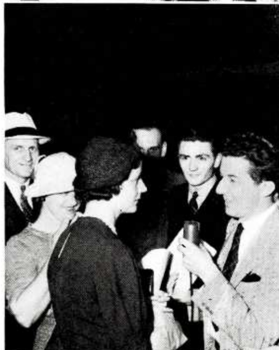
(Top, right) Answering questions in the lobby was this group of journalism students from Northwestern Institute. The young lady being interviewed was from Arizona.