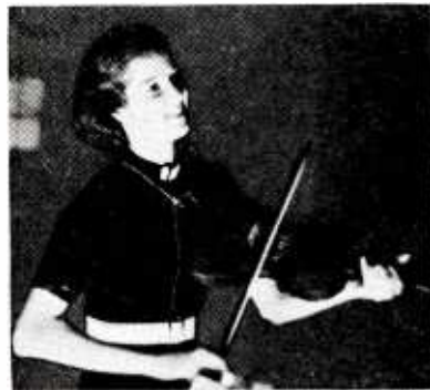
Hitch-hiked 20 miles . . .