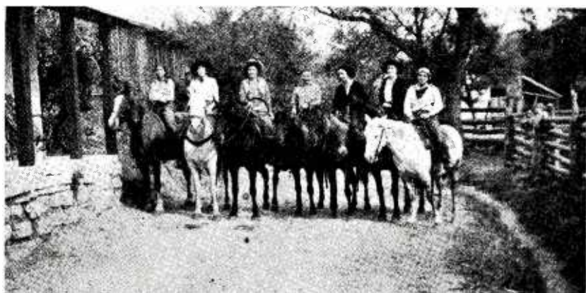
Seven reasons why cowboys get homesick. . . .

all of whom each got a big buck. Major Stark is a crack-shot all right, and he got the biggest one of the bunch. His weighed 204 which is extra big for these wild ones. He is having the head mounted and will hang it on the wall in the Executive mansion at Jeff City or somewhere else.