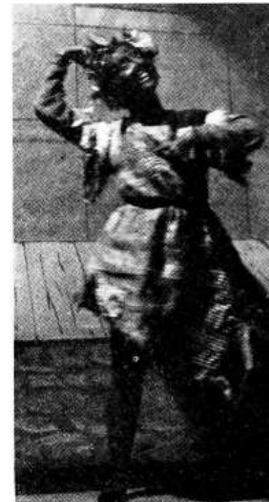
From doormouse to Topsy . . .

years old, she started taking lessons in violin, piano and expression. She stopped taking piano lessons after her first recital, then dropped the study of violin, and concentrated on her speech work. Her first performance before an audience didn't show much promise of what her future career was to be.