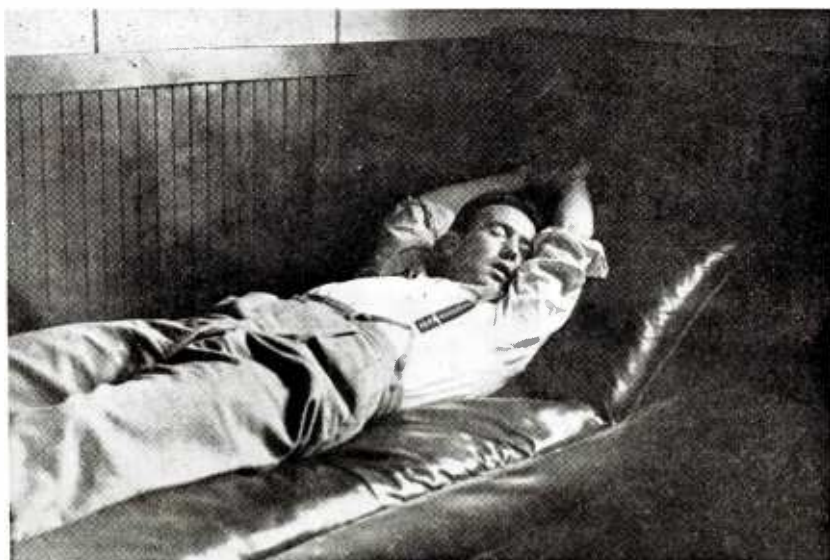
TIRED OUT from some strenuous programs, Ramblin' Red Foley catches 40 or maybe 50 winks not far from the studio.